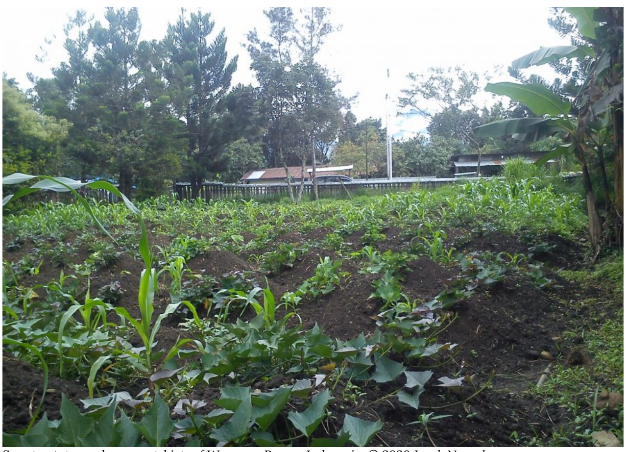
Sweet potato garden on outskirts of Wamena, Papua, Indonesia.

Compared to residents of Indonesia's cities, the capacity to cultivate their own food makes indigenous smallholders in La Pago in some ways better equipped to withstand the pandemic's interruption of regular economic life. Claims to authority over inbound travel by public representatives in Papua signal a combination of vulnerability due to inadequate health infrastructures, and partial leverage over transportation due to the region's relative disconnection. The pandemic has allowed this contradictory combination to complicate Indonesia's inter-governmental politics in the long wake of decentralization.