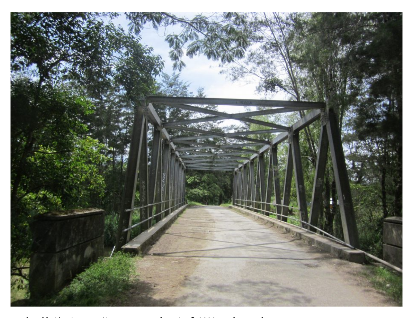
Road and bridge in Jayawijaya, Papua, Indonesia.

Shortly after regional travel restrictions were implemented, the Papua conflict returned to the news. On 30 March, an attack attributed to the West Papua Liberation Army killed a Freeport miner from New Zealand, and military pursuit of those responsible resulted in further casualties (Bayer 2020). Meanwhile in Jakarta, six pro-independence protesters were facing trial. Reappearance of violence has heightened controversy over the legitimacy of regional administrations' boundary enforcements. It remains to be seen whether and how the central government may incorporate such regional initiatives into its mechanisms for responding to public health emergencies.