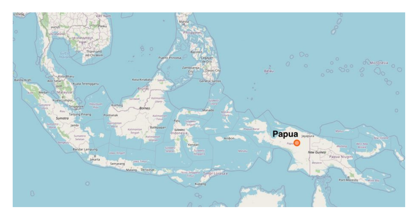
Map of Indonesia showing location of Papua, with Wamena marked in red.

While Autonomy in Papua aimed specifically to resolve the conflict there, it took shape alongside a wider post-crisis state decentralization promoted by the IMF and advised by the World Bank. These reforms saw discourses of 'good governance' applied to various agendas including defusing separatism; partial transfer of social protection functions and extractive revenues from the center to regions; and facilitation of construction and resource extraction firms' direct access to regional administrations (Aragon 2007; Habibi and Juliawan 2018; Sangadji 2017; Silver 2003). In Papua, the Autonomy era has seen sporadic turbulence, as independence agitations and repression wax and wane. In particular, serious incidents of violence took place in many cities including Wamena in August and September 2019. Since the onset of the pandemic in Papua, local representatives and groups in La Pago have taken the lead and actively restricted inbound transportation (Gokkon 2020). These actions have had an assertiveness that has agitated relations between the center and regions in general.