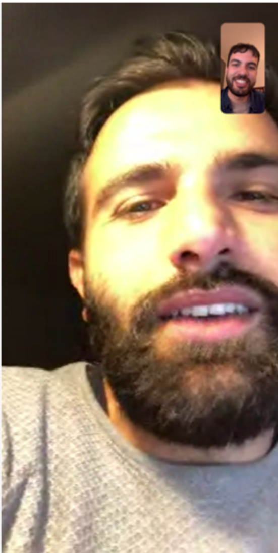
Image 1: Conversation with Yener.

Sailesh started a twitter campaign to reach the Embassy officials: „Since I am only a resident I am just another number to them, and a flight leaves tomorrow that I want to get on. Since I am in a remote region, it may be close to six months before the border restrictions are lifted and I am able to fly back.“