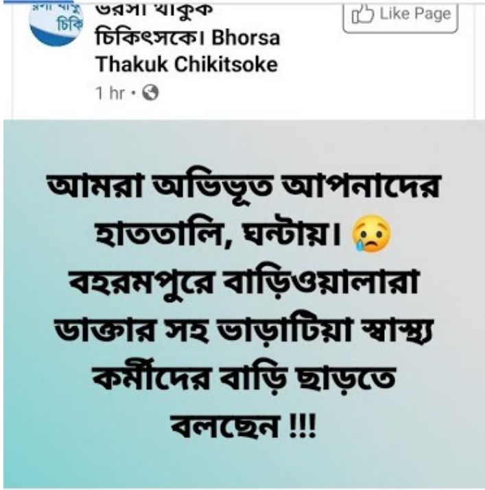
Image 6. The Bengali texts reads: We are overwhelmed by your applause and bells. At Baharampur (a district in West Bengal) landlords are asking doctors and other medical staff to vacate their homes. Source: Facebook page of 'Bhorsa Thakuk Chikitsoke', https://www.facebook.com/WBDF2017/posts/1309095419478694 , last accessed on 10 April 2020

implications for the spread of infection.