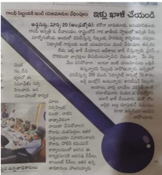
Image 7. A photo clicked from a Telugu newspaper that reports the eviction of doctors by landlords.

We must also look into the problems of hospital staff . Govt must immediately react to this . Gandhi Sub staff, security guards were asked to vacate the houses by owners due to fear of #Corona .#TRS #KTR