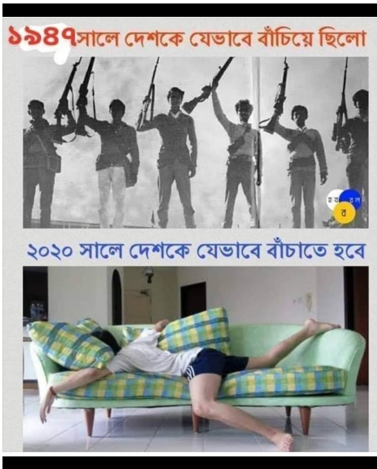
Image 4. The different ways of saving the country, in 1947 and in 2020.