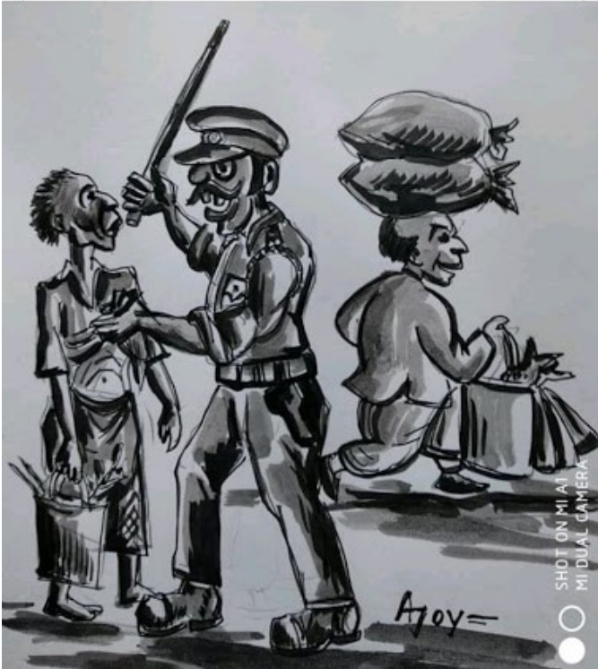
Image 8. The Bangla legend reads 'Police, you are a brave man, beating up the poor whenever you see them. You salute the rich a thousand times...' The hand drawn images shows a policeman in uniform about to hit a poor man with a grocery bag, while a well dressed man with a sacks full of food leave unnoticed.