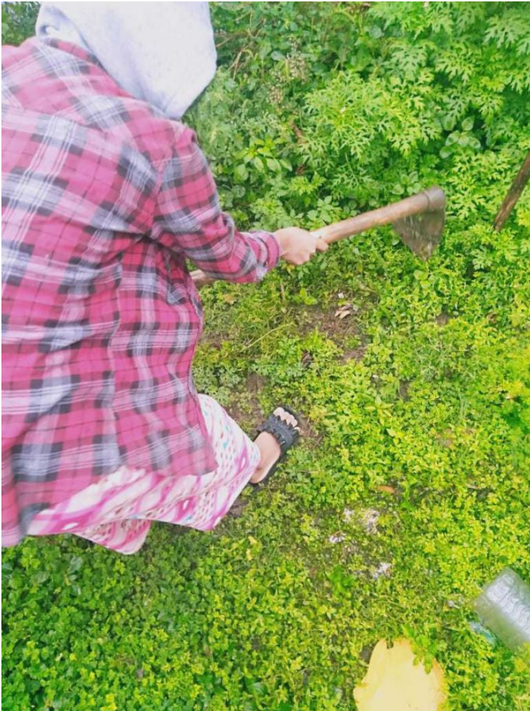
Figure 3: A student at work gardening during the COVID-19 lockdown in Dimapur, Nagaland.

Recently, when I called a student to find out why he was late in submitting an assignment, I found out that a few of them have signed up as volunteers guarding the porous boundaries of their districts to prevent illicit traffic of outsiders who might bring the virus closer to home (Figure 4, 5). They have been sleeping in open sheds,