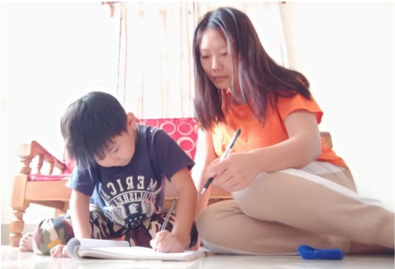
Figure 2: A student teaches her nephew during the COVID-19 lockdown in Dimapur, Nagaland.

students sent to me or shared over social media show that they are spending time now working in fields, catching fish, cooking, feeding, and taking care of children, taking up the responsibility of care in a large household (Figure 2, 3). [4] Besides, many of them live in houses with two rooms separated by a bamboo weave. How can students, in this context, be expected to spend two or three hours in inviolable privacy to attend the online classes which a teacher is supposed to conduct every day?