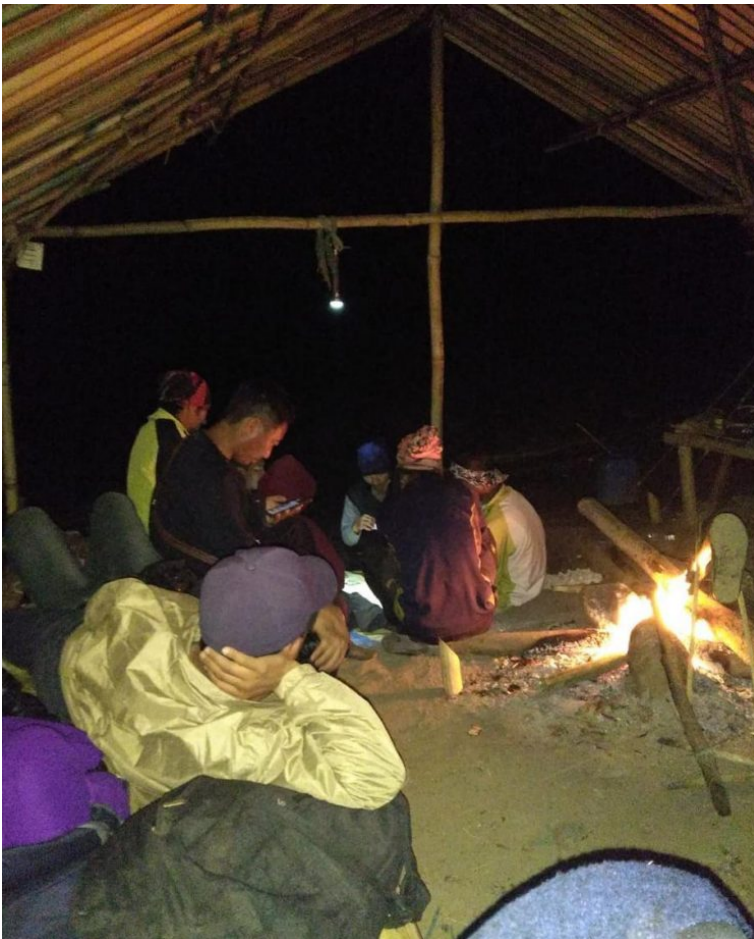
Figure 4 and 5: Youngsters watch over the Assam-Nagaland border to prevent illegal traffic during the lockdown.

and having food and changing at the local police station. They have not been home for over any considerable duration of time during the past three weeks.