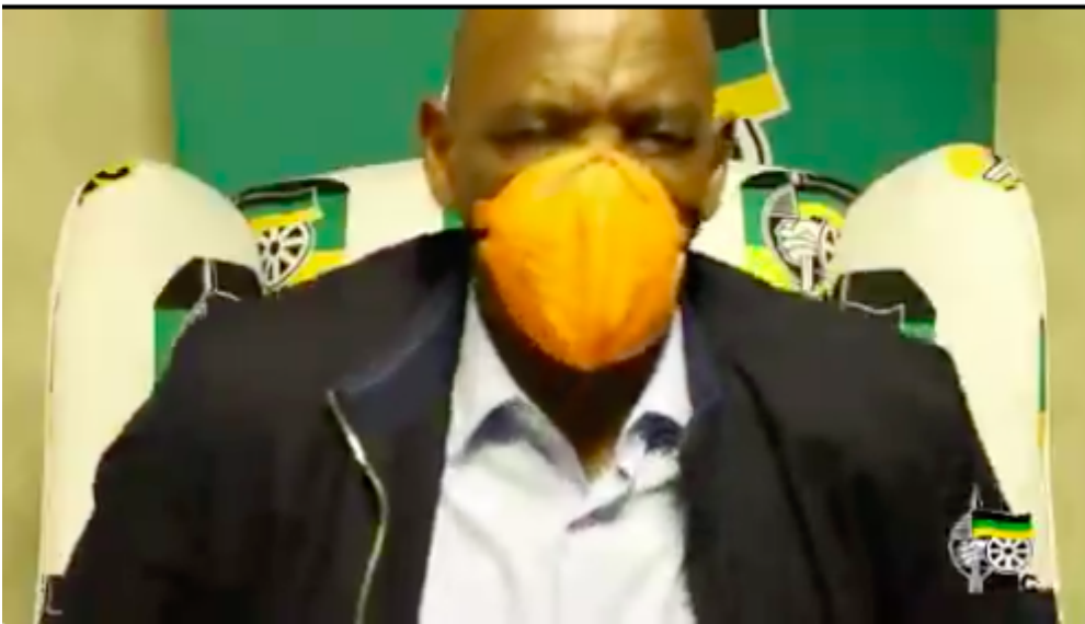
The Secretary General of the African National Congress speaking with a yellow face mask to the South African public about beating Coronavirus.

@MYANC Secretary General Ace Magashule calls on South Africans to supports all efforts to curb and eradicate the #Coronavirusoutbreak. #CODVID19 #CoronaVirusSA #ProtectYourself #DefendEachOther #LetsDoltTogether