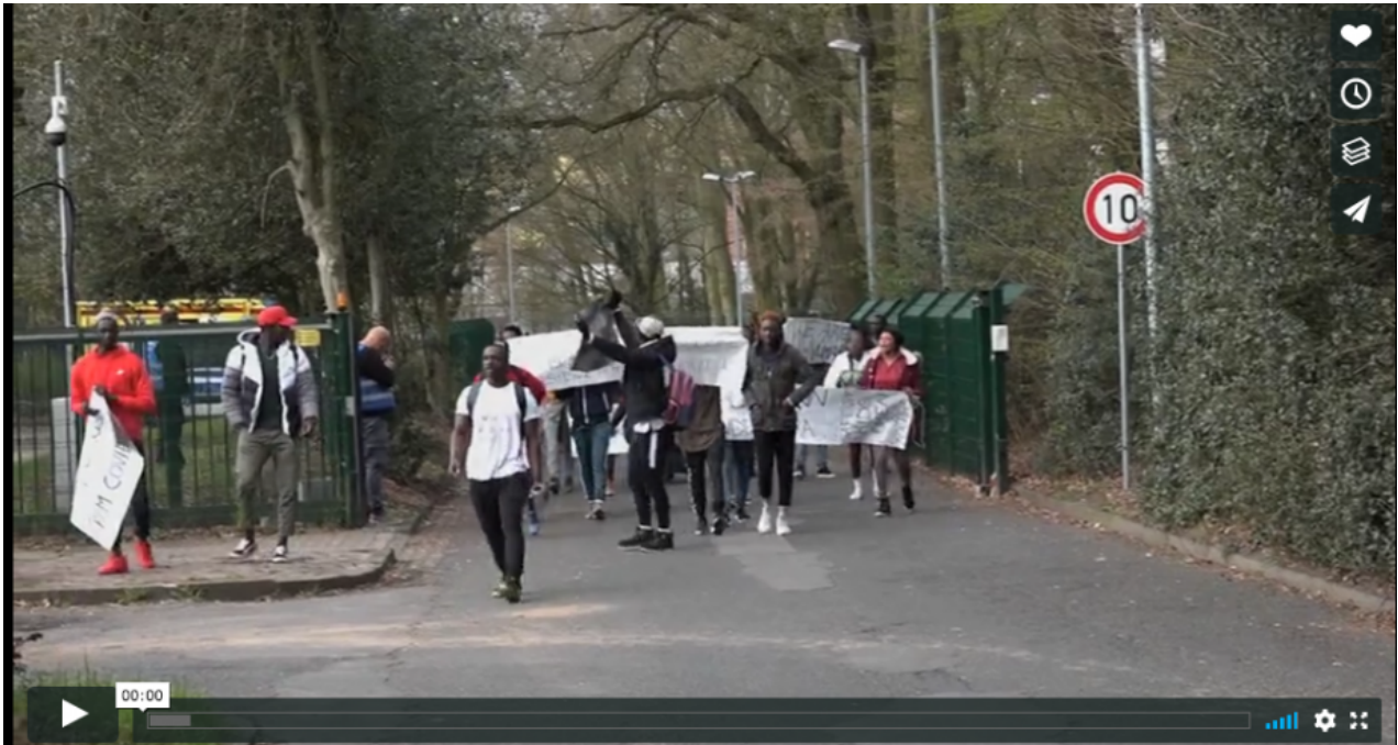
Thumbnail I: Video-Clip of the rally on March 27, 2020. The author has permission to use the video.

At the rally, everyone stood in fulfilling the demanded social distance of 2 meters. Yet, when people only briefly exceeded the ban on contact, charges for violation of the infection protection law ( das Infektionsschutzgesetz, IfSG ) were made immediately by the Bremen police department (cf. TAZ 2020d). The first rally during the Corona times in Bremen was accompanied by an online campaign of Together We Are Bremen , a press release of the Bremen Refugee Council, and an online petition .