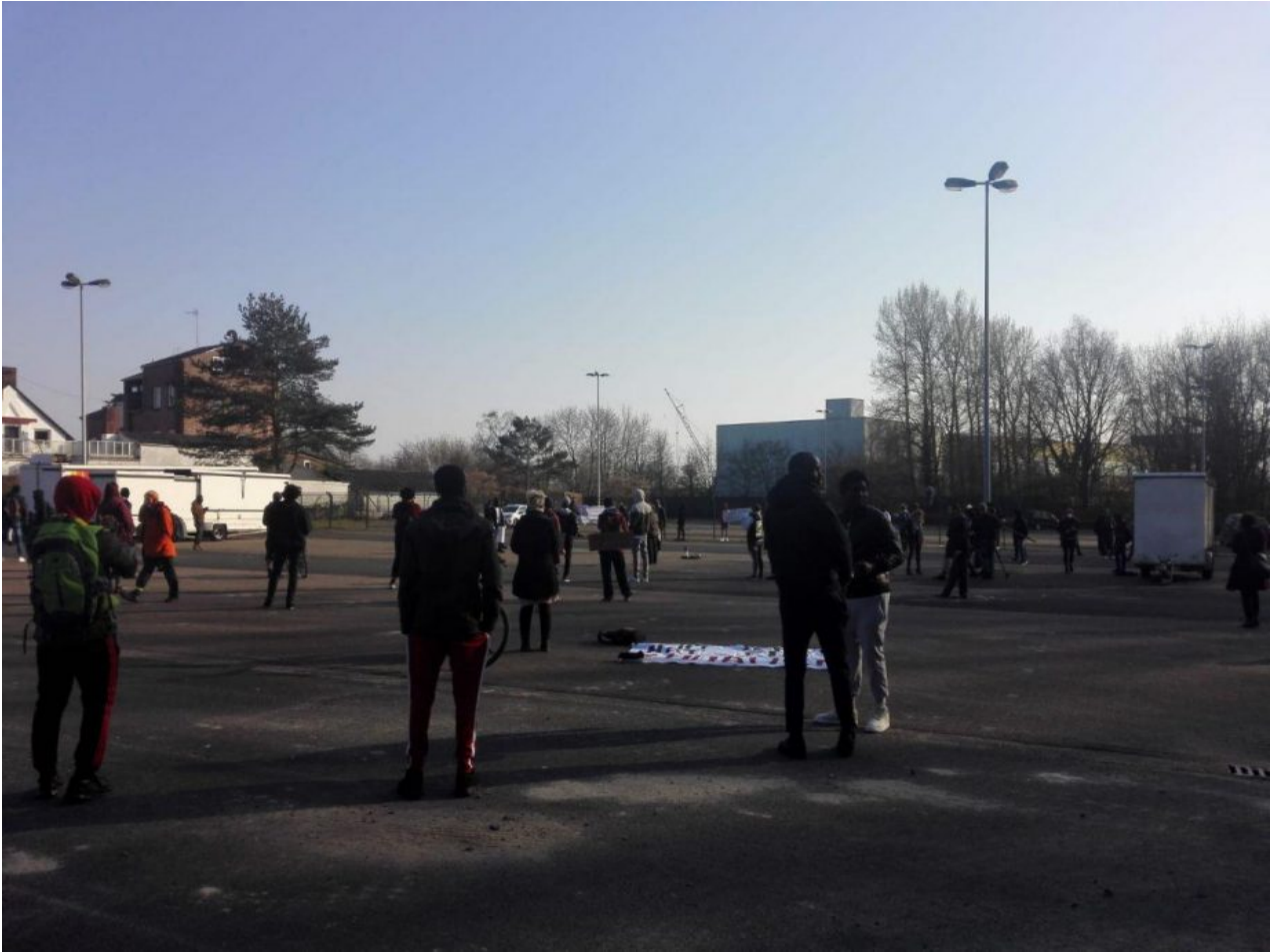
Illustration III: Protest rally in front of the Lindenstraße reception center on March 27, 2020. The author has permission to use the image.