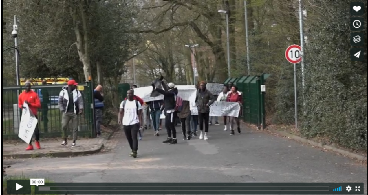
Thumbnail I: Video-Clip of the rally on March 27, 2020. The author has permission to use the video.

At the rally, everyone stood in fulfilling the demanded social distance of 2 meters. Yet, when people only briefly exceeded the ban on contact, charges for violation of the infection protection law ( das Infektionsschutzgesetz, IfSG ) were made immediately by the Bremen police department (cf. TAZ 2020d). The first rally during the Corona times in Bremen was accompanied by an online campaign of Together We Are Bremen , a press release of the Bremen Refugee Council, and an online petition .