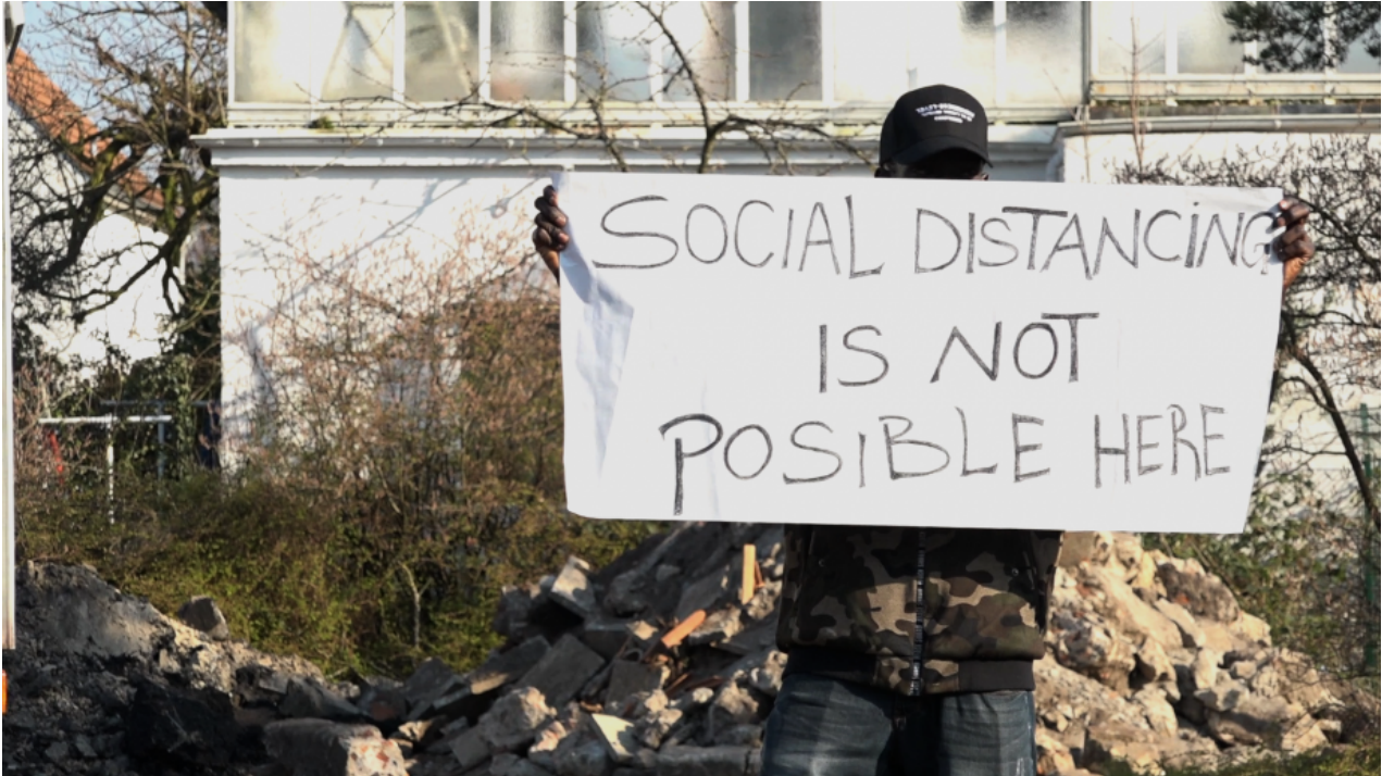
Illustration II: Protest rally in front of the Lindenstraße reception center on March 27, 2020. Copyright: Anne Frisius. The author has permission to use the image.