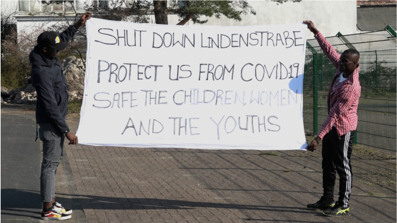
Illustration I: Refugees in Bremen protesting in front of the refugee reception center on Lindenstraße, March 27, 2020. Copyright: Anne Frisius. The author has permission to use the image.

As a form of „organized disintegration“ by the state (Täubig 2009), the people living here drop not only out of many neighborhood helping initiatives currently being organized but also out of public awareness. On the one hand, the police and public order offices admonish people to observe the rules of social distancing in public space and sometimes impose severe penalties for violations of such regulations. On the other hand, people in mass accommodation are forced by the government agencies to violate these same contact bans permanently, endangering themselves and others. What becomes apparent here is that vulnerability is not, as Ferrarese (2020) has emphasized, primarily immanent to a physical constitution, but „something that is in between subjects, or a subject and an organization, a subject and an institution [...]. If we speak about vulnerability, we speak about institutions’ power to act.”