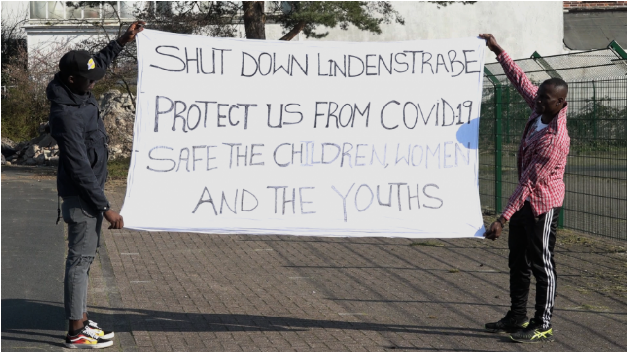
Illustration I: Refugees in Bremen protesting in front of the refugee reception center on Lindenstraße, March 27, 2020. The author has permission to use the image.

As a form of „organized disintegration“ by the state (Täubig 2009), the people living here drop not only out of many neighborhood helping initiatives currently being organized but also out of public awareness. On the one hand, the police and public order offices admonish people to observe the rules of social distancing in public space and sometimes impose severe penalties for violations of such regulations. On the other hand, people in mass accommodation are forced by the government agencies to violate these same contact bans permanently, endangering themselves and others. What becomes apparent here is that vulnerability is not, as Ferrarese (2020) has emphasized, primarily immanent to a physical constitution, but „something that is in between subjects, or a subject and an organization, a subject and an institution [...]. If we speak about vulnerability, we speak about institutions’ power to act.”