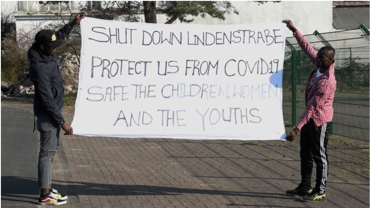
Illustration I: Refugees in Bremen protesting in front of the refugee reception center on Lindenstraße, March 27, 2020. Copyright: Anne Frisius. The author has permission to use the image.

As a form of „organized disintegration“ by the state (Täubig 2009), the people living here drop not only out of many neighborhood helping initiatives currently being organized but also out of public awareness. On the one hand, the police and public order offices admonish people to observe the rules of social distancing in public space and sometimes impose severe penalties for violations of such regulations. On the other hand, people in mass accommodation are forced by the government agencies to violate these same contact bans permanently, endangering themselves and others. What becomes apparent here is that vulnerability is not, as Ferrarese (2020) has emphasized, primarily immanent to a physical constitution, but „something that is in between subjects, or a subject and an organization, a subject and an institution [...]. If we speak about vulnerability, we speak about institutions’ power to act.”