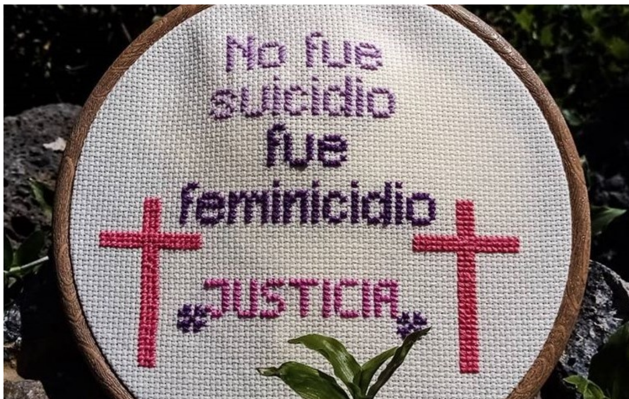
Image 3: The text reads: "It was not suicide, it was femicide. Justice" (3 May, 2020).

Even though the public debate on VAWG came to a temporary halt due to the COVID-19 outbreak, the same event has brought it back into the spotlight. Since the beginning of the stay-at-home orders in March, emergency hotlines, the police, and women's shelters are reporting a drastic increase in the number of calls.