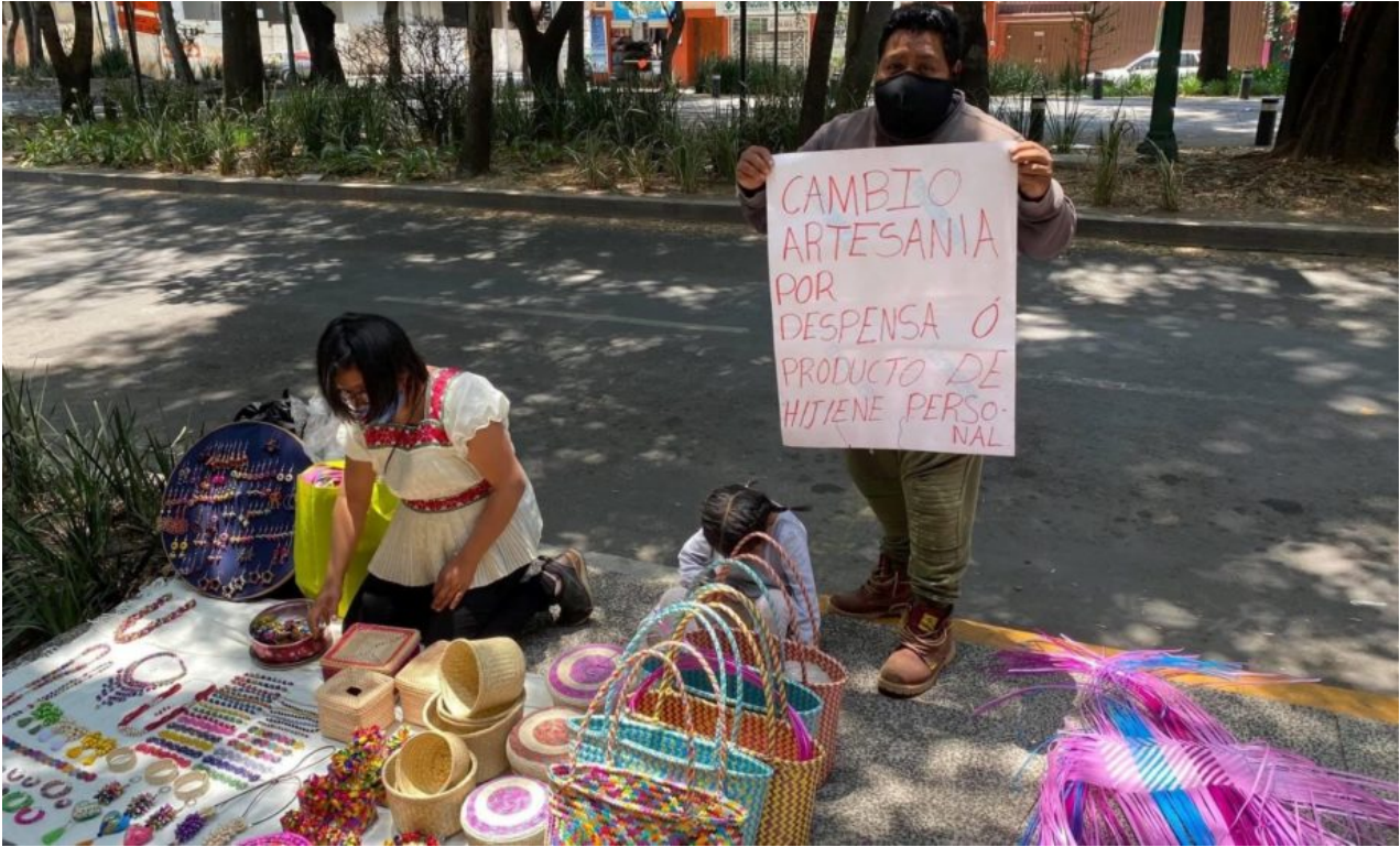
Image 2: A family offering handicrafts in exchange for food and hygiene products in the streets of Mexico City.

A distinctive feature of Mexican health communication, which extends to the Susana Distancia campaign, is the frequent use of comics. According to Green and Myers (2010: 474), the advantage of this narrative media lies in the fact that “their powerful visual messages convey immediate visceral understanding in ways that conventional texts cannot.” Comics are, therefore, particularly appropriate for disseminating health information across different target groups and enhancing understanding. Their iconographic meanings reach adults and children as well as people with low literacy or different language skills. The latter two aspects are especially relevant in the Mexican context, which is characterized by linguistic and cultural diversity and an elevated illiteracy rate among the elderly (INEGI 2010).