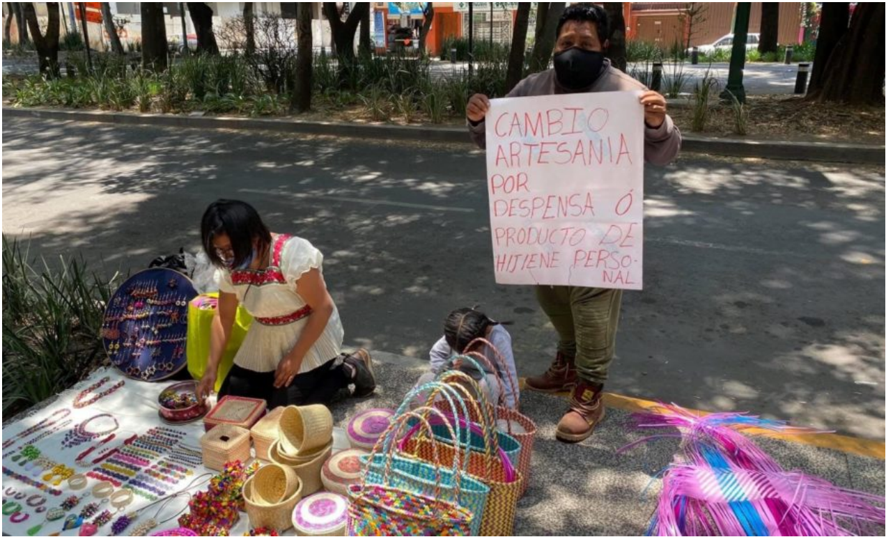
Image 2: A family offering handicrafts in exchange for food and hygiene products in the streets of Mexico City.

A distinctive feature of Mexican health communication, which extends to the Susana Distancia campaign, is the frequent use of comics. According to Green and Myers (2010: 474), the advantage of this narrative media lies in the fact that “their powerful visual messages convey immediate visceral understanding in ways that conventional texts cannot.” Comics are, therefore, particularly appropriate for disseminating health information across different target groups and enhancing understanding. Their iconographic meanings reach adults and children as well as people with low literacy or different language skills. The latter two aspects are especially relevant in the Mexican context, which is characterized by linguistic and cultural diversity and an elevated illiteracy rate among the elderly (INEGI 2010).