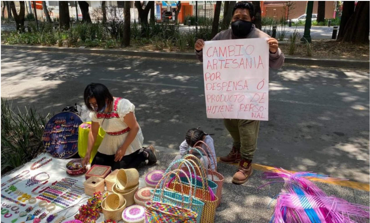
Image 2: A family offering handicrafts in exchange for food and hygiene products in the streets of Mexico City.

A distinctive feature of Mexican health communication, which extends to the Susana Distancia campaign, is the frequent use of comics. According to Green and Myers (2010: 474), the advantage of this narrative media lies in the fact that “their powerful visual messages convey immediate visceral understanding in ways that conventional texts cannot.” Comics are, therefore, particularly appropriate for disseminating health information across different target groups and enhancing understanding. Their iconographic meanings reach adults and children as well as people with low literacy or different language skills. The latter two aspects are especially relevant in the Mexican context, which is characterized by linguistic and cultural diversity and an elevated illiteracy rate among the elderly (INEGI 2010).