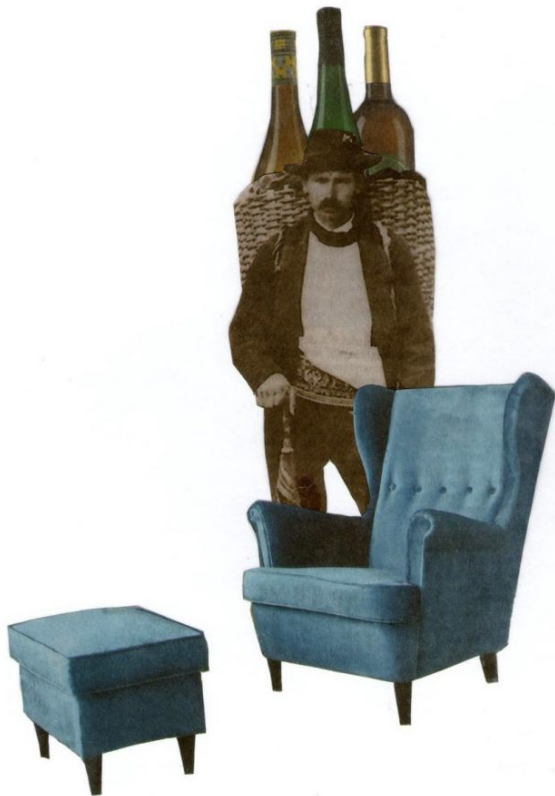
Collage 3: 'Home Sweet Home?'.