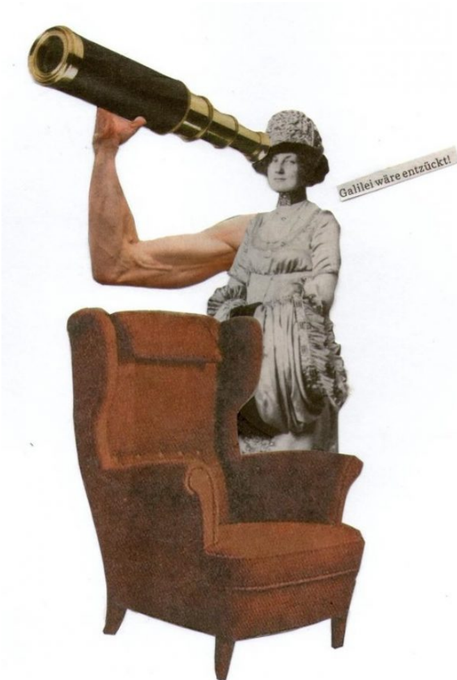
Collage 1: 'Galilei would be delighted'.