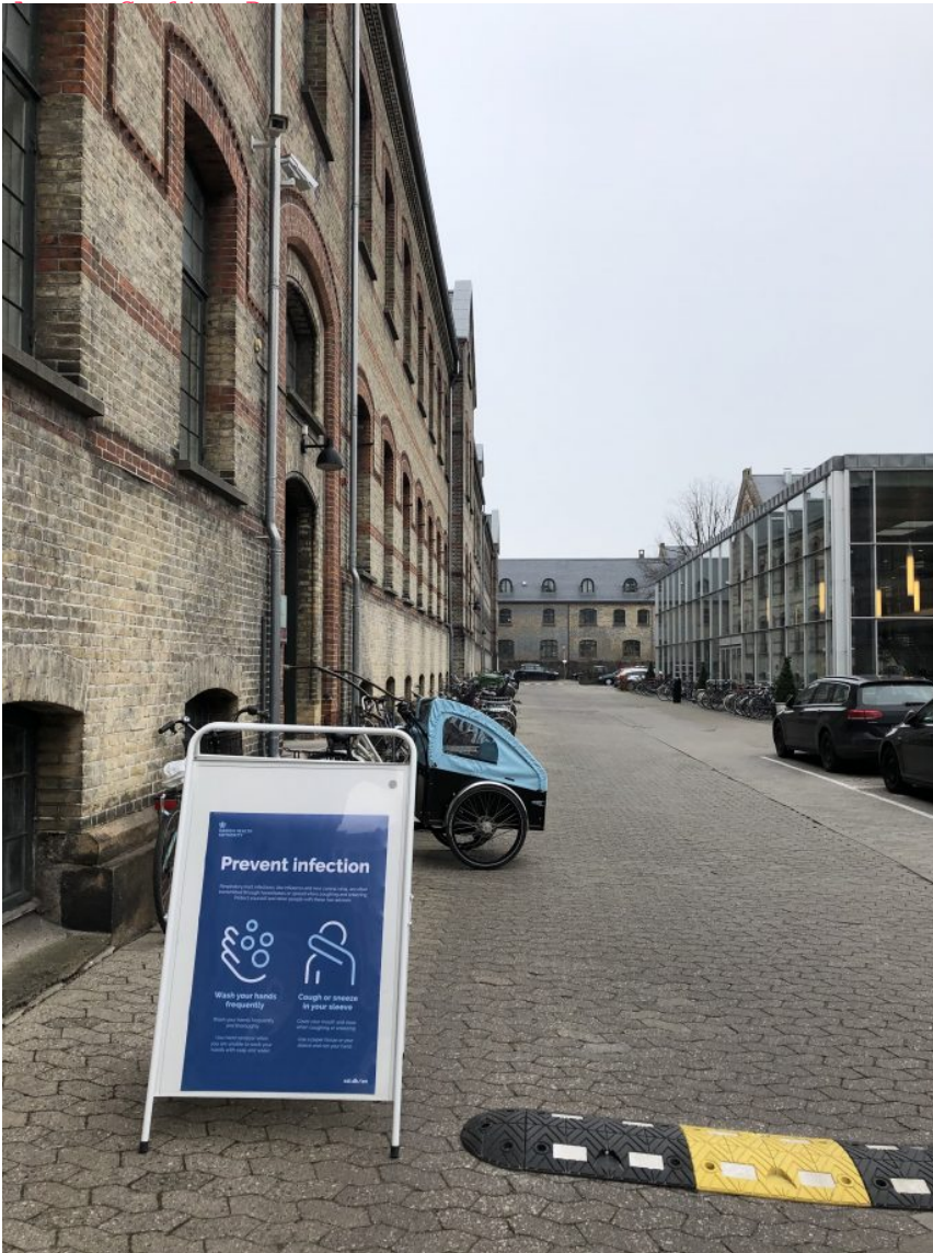
Anti-Covid-19 measures by the Danish government in front of our department in Copenhagen, 6 March 2020.

However, “the coronavirus” was not only a phenomenon that affected our daily lives. With the recently discussed anthropological concepts and tools, we recognized how it also was a phenomenon through which scientific facts, illness and health, prevention and cure, the nation state and citizenship became and are still becoming reconfigured. Wasn’t this what medical anthropology is all about? Like lecturer