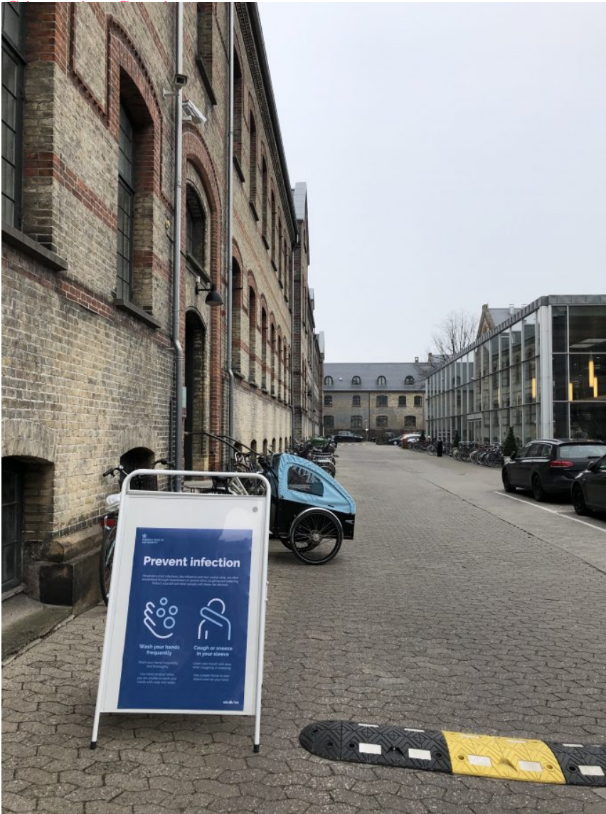
Anti-Covid-19 measures by the Danish government in front of our department in Copenhagen, 6 March 2020.

However, “the coronavirus” was not only a phenomenon that affected our daily lives. With the recently discussed anthropological concepts and tools, we recognized how it also was a phenomenon through which scientific facts, illness and health, prevention and cure, the nation state and citizenship became and are still becoming reconfigured. Wasn’t this what medical anthropology is all about? Like lecturer