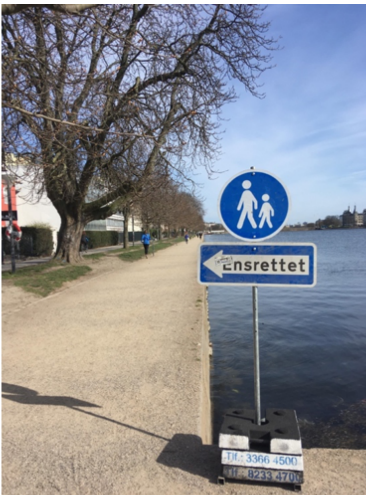
The municipality put up one-way road signs, for runners and pedestrians

current recommendations, and the initiative from individuals to act responsibly, and succumb and enhance state recommendations points to a high amount of trust in the Danish state from the individual citizen. When citizens face crises that are as incomprehensible as a global pandemic, they rely on the trust in the knowledge, action, and recommendations that the government provides. I argue that it is due to the legacy of the social welfare state that citizens in Denmark have exhibited a high amount of trust in the government, which in turn has resulted in a high level of individual compliance, and proud announcements from people on social media, showing that we are doing our part .