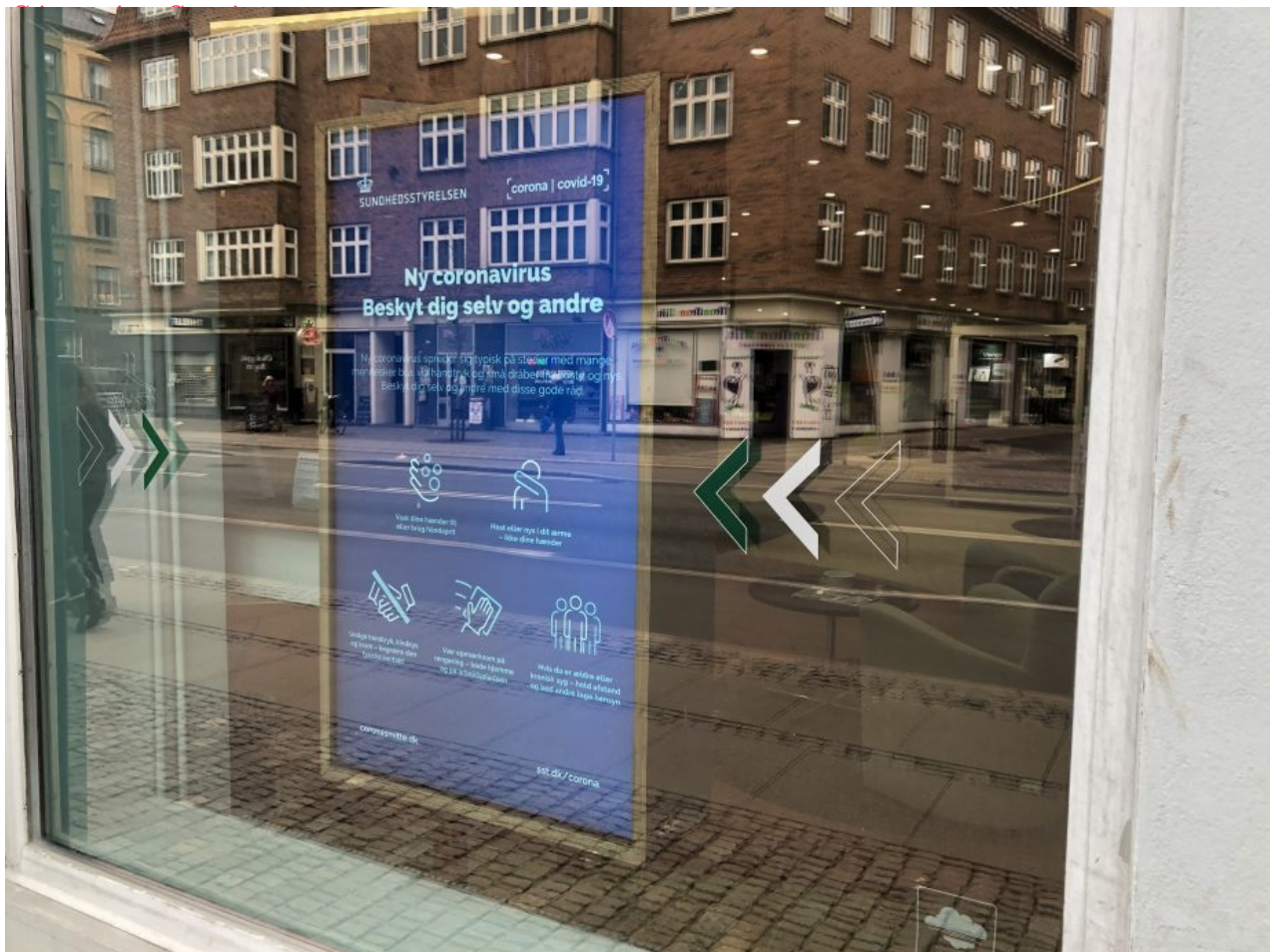
Public signs in Copenhagen illustrating health regulations.