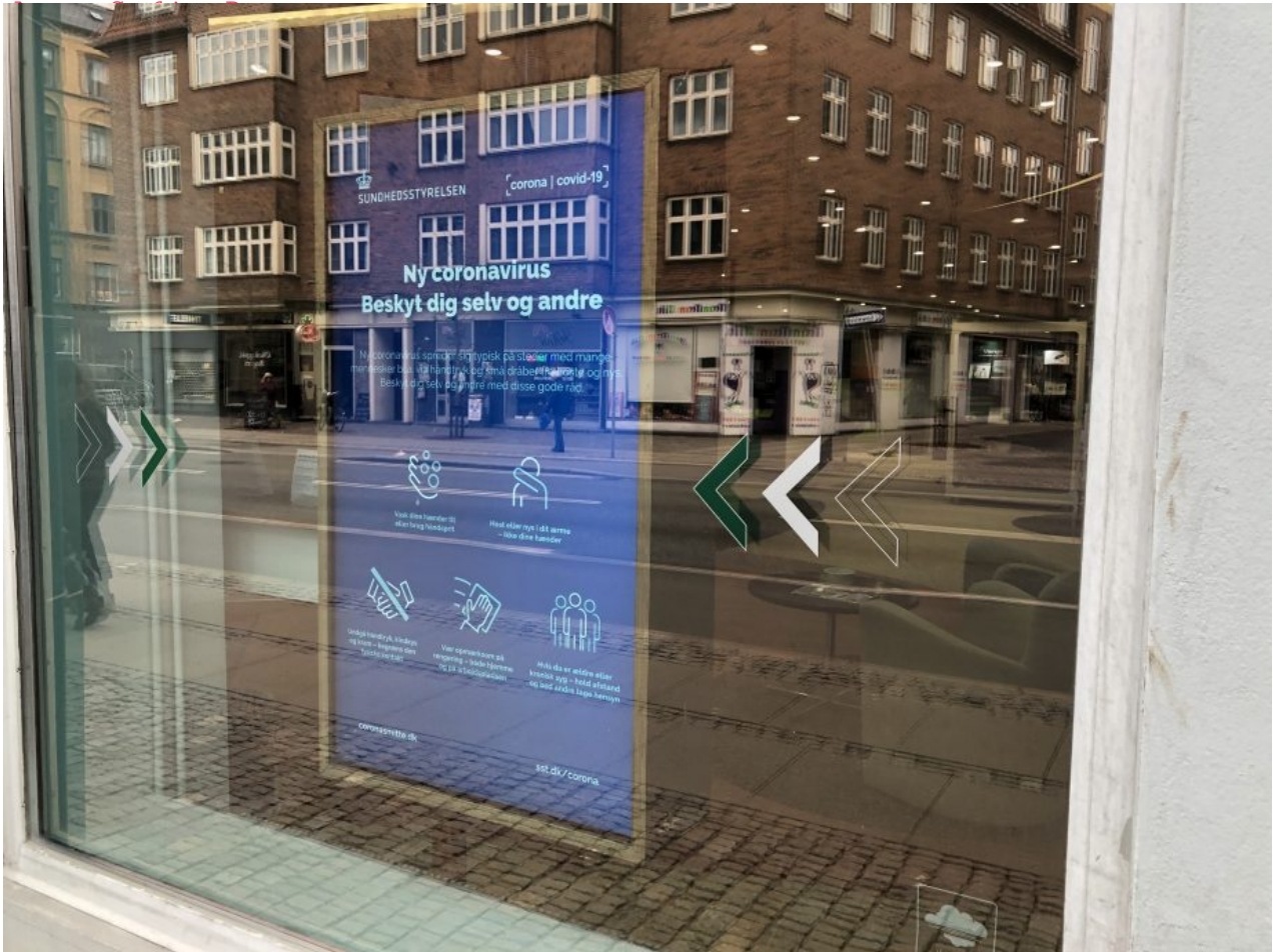
Public signs in Copenhagen illustrating health regulations.