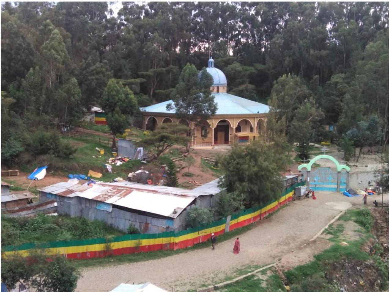
A view of the Church of Saint Mikael, in the area of Bole, Addis Ababa. 6 May 2020.

endorsed the legitimacy of kings' authority. For this reason, the Ethiopian Orthodox Tewahedo Church had a front-row role on the political scene up to the fall of the monarchy in 1975. Even during the dictatorship that followed, when all religious beliefs were strongly repressed, the Church managed to use its moral authority to condition the population, a reminder to the government of its retained power, proving that it was still holding its own (Pili 2009).