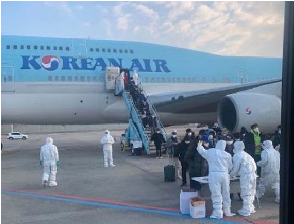
Expat Koreans getting out of charter flight from China.

This hostile sentiment towards expat Koreans was reinforced after several cases of infections coming from abroad were reported. Korean students studying abroad recently have been a new threat, such that a neologism ‘ students studying abroad-phobia ’ has been coined. The situation became worse after a Korea student in the United States did not respect the self-isolation regulation and traveled despite having coronavirus symptoms. Moreover, since 13 cases were found in the district known to be the richest neighborhood of Seoul, the hostility is now towards those who are ‘rich enough to study abroad and selfish enough to bring back the virus.’ (ibid.)