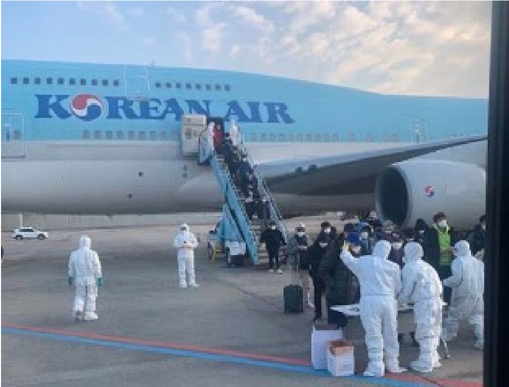
Expat Koreans getting out of charter flight from China.

This hostile sentiment towards expat Koreans was reinforced after several cases of infections coming from abroad were reported. Korean students studying abroad recently have been a new threat, such that a neologism ‘ students studying abroad-phobia ’ has been coined. The situation became worse after a Korea student in the United States did not respect the self-isolation regulation and traveled despite having coronavirus symptoms. Moreover, since 13 cases were found in the district known to be the richest neighborhood of Seoul, the hostility is now towards those who are ‘rich enough to study abroad and selfish enough to bring back the virus.’ (ibid.)