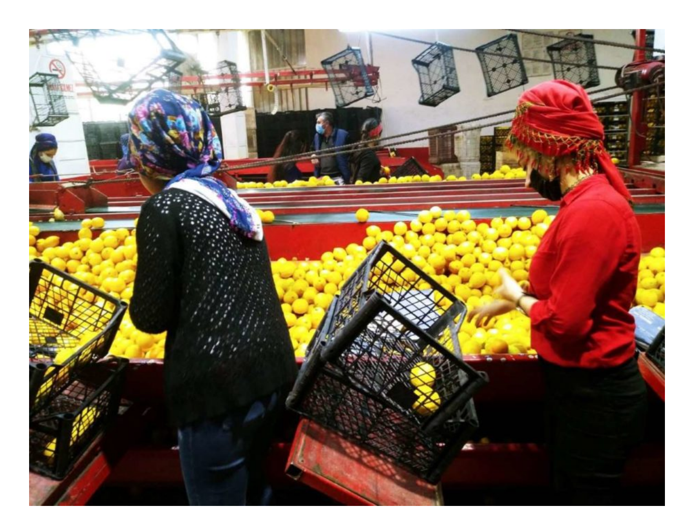
Women working in a citrus fruit packaging factory. February 2021.