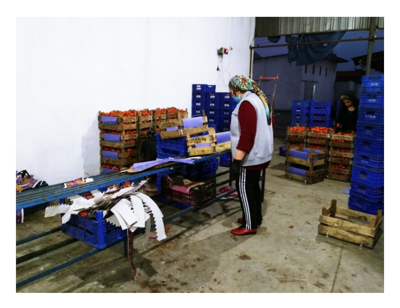
Villagers doing the work of tomato packaging. February 2021.

At the beginning of the pandemic, it was surprising to witness that my agricultural worker interlocutors were not perceiving the coronavirus pandemic as a problem while people around the world were in a panic. For agricultural workers who are deprived of any worker rights while, at the same time, being exposed to poor living conditions, "staying at home" would be a problem. A young Syrian female interlocutor working at the wholesale fruit and vegetable market in my fieldsite, explains: "When they first told us about the pandemic here, they started imposing prohibitions, as you know. They told us it was forbidden to work in the wholesale market, and they imposed a curfew, at first on Saturdays and Sundays… So that was a