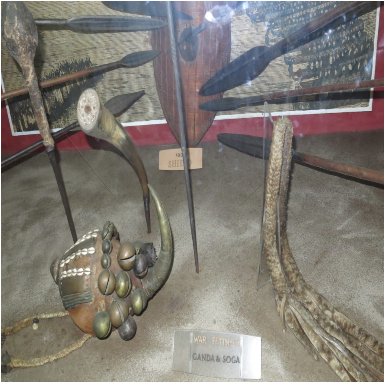
Fig. 3: Artifacts labeled as „War Fetishes” at the Ethnography gallery, Uganda Museum. From: Abiti 2022, p. 34

Museums were part of technologies to turn people into colonial subjects that needed to be “civilized” and adapted to the needs and constraints of extractivist colonial regimes. Europeans implementing the extractivist policies were often aware of the