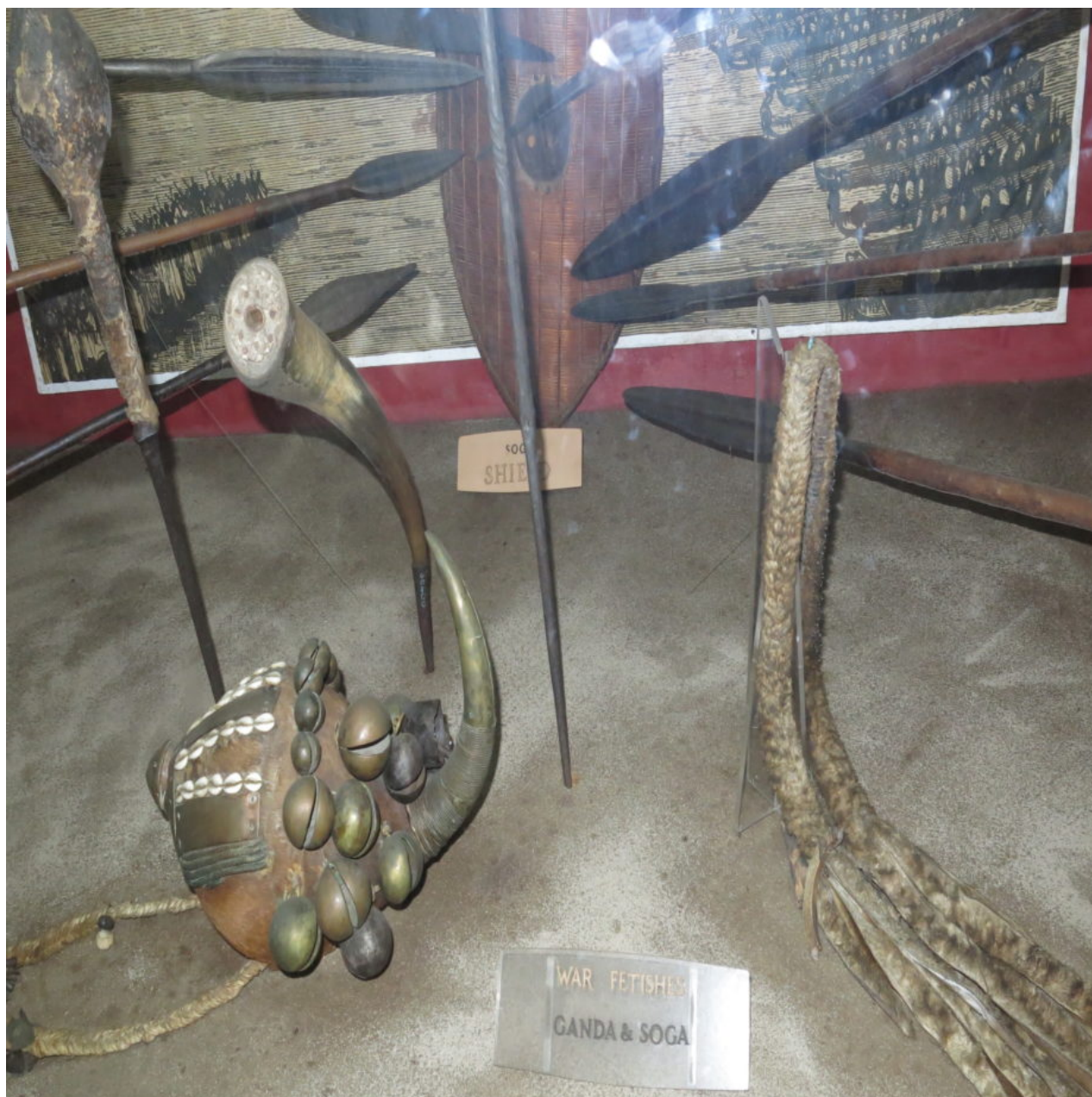
Fig. 3: Artifacts labeled as „War Fetishes” at the Ethnography gallery, Uganda Museum. From: Abiti 2022, p. 34, photo: Nelson Adebo Abiti

Museums were part of technologies to turn people into colonial subjects that needed to be “civilized” and adapted to the needs and constraints of extractivist colonial regimes. Europeans implementing the extractivist policies were often aware of the