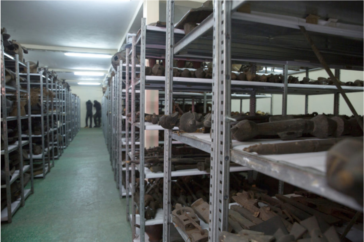
Fig. 4. View into the Depot, Museum of Civilizations, Abidjan, from Kassi 2022, p.130, photo: Museum of Civilizations

Much of the current debate on decolonizing the museum centers on how the immobilized and devitalized objects confined within museum walls (Marker/Resnais/Cloquet 1953) can regain an agentive quality and help rebuild the social fabric that has been distorted and disfigured by colonial and postcolonial violence. In their contributions, authors to this debate describe how objects in museums can be known, be enacted, and come to the fore differently from the way they were “known”, preserved, and practiced in the long history of their colonialized, institutionalized, and museumized existence.