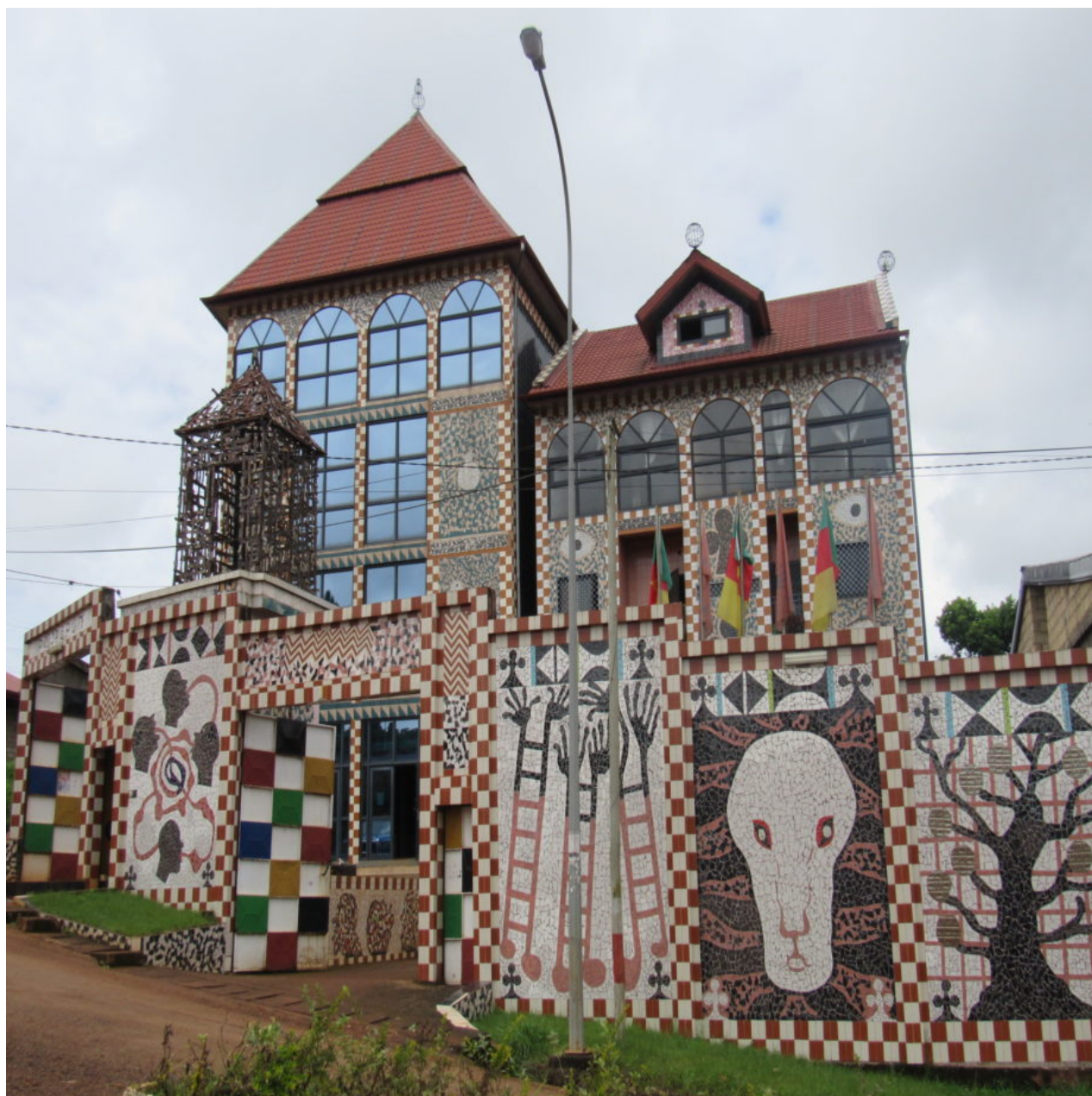
Bandjoun station, front side with wall painting, Toguo et al. 2022, p.138