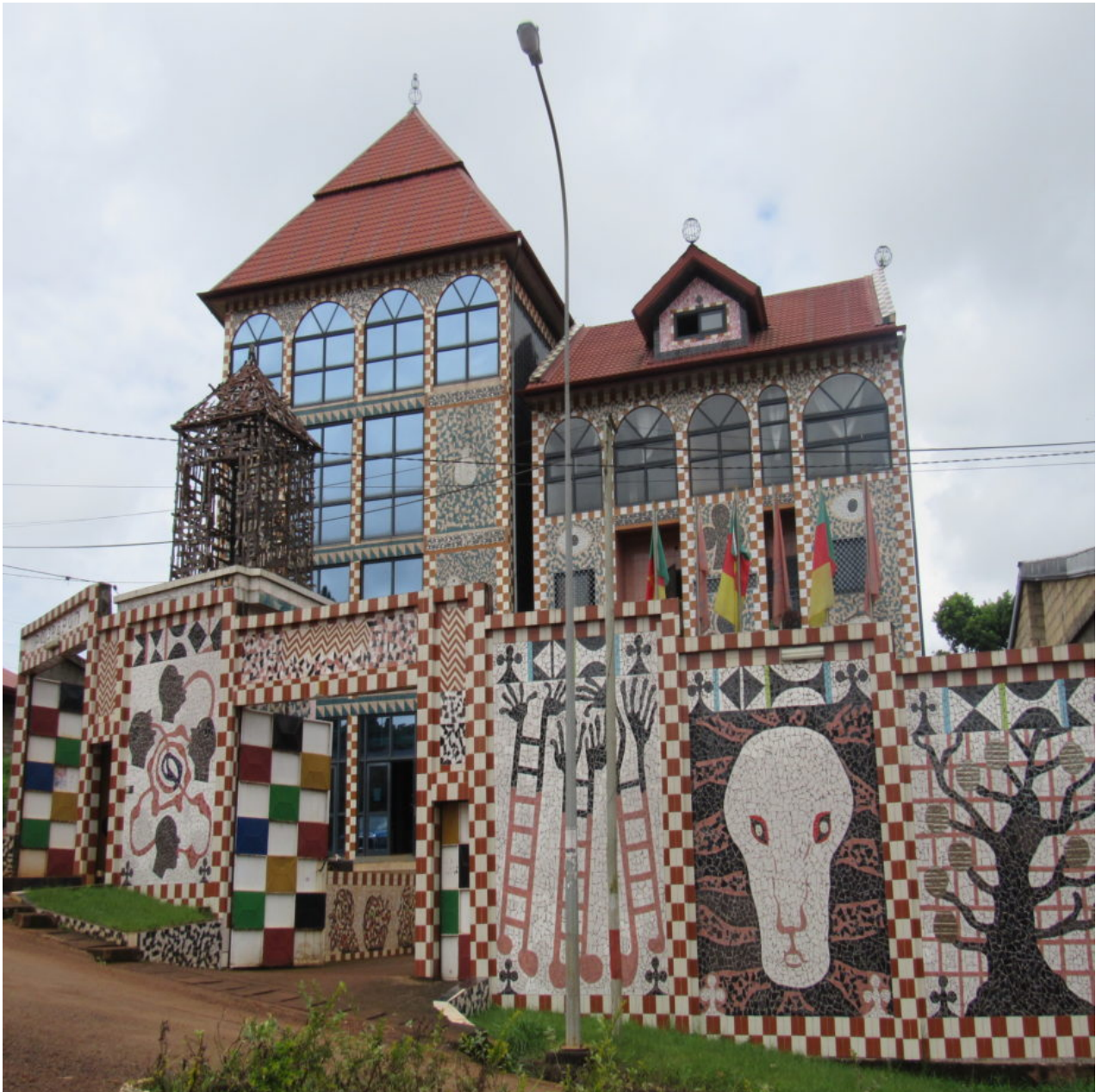
Bandjoun station, front side with wall painting, Toguo et al. 2022, p.138