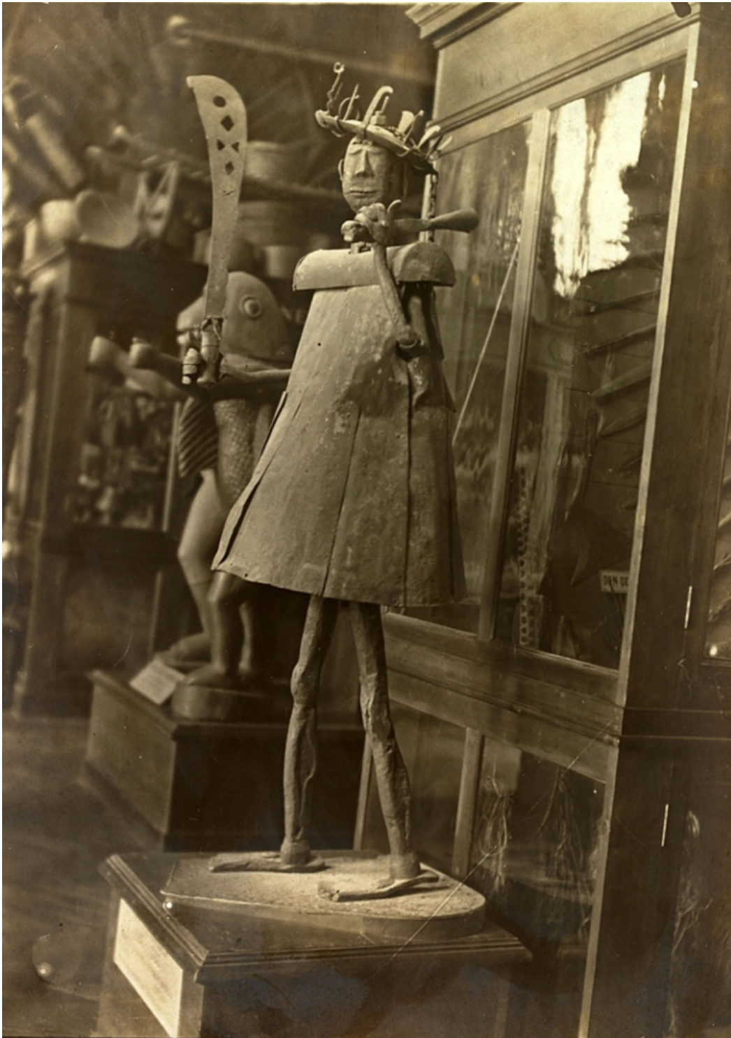
Statue devoted to the Gou god (vodun or voodoo) photographed in the rooms of the Musée d'Ethnographie du Trocadéro at the end of the 19th