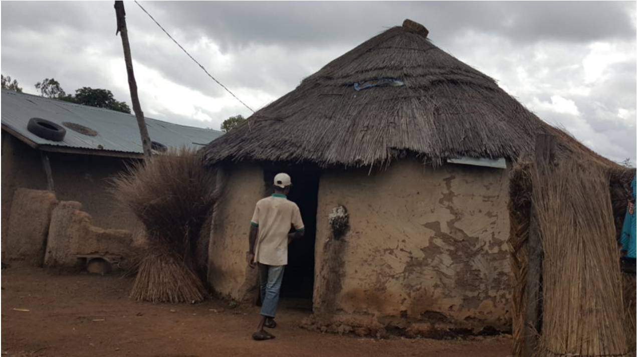
Fig. 5: Entering the family house, Bapuré. Photo: Bernard Müller, November 2018.

In the ethnographic collections in Saxony, Germany (Staatliche Ethnographische Sammlungen Sachsen im Verbund der Staatlichen Kunstsammlungen Dresden), one object in particular caught our attention: a signal whistle («Signalpfeife», inventory number MAF 1268). Insignificant though this may at first appear, it actually facilitated the Konkomba in challenging German soldiers, as is attested in the archives (Klose 1906). Known to hunters, it functions by way of coded sounds indicating directions. The whistle was supposedly »purchased« – there are grounds to doubt this – and integrated into the collection in 1900. Seemingly banal, it most likely provided Konkomba warriors with a means of taking their enemy by surprise given that the sound, which is similar to that of a particular bird, was unknown to the Germans. This function, militaristic so to speak, explains why it was seized by agents of Lieutenant Gaston Thierry when he came to the rescue of Gruner’s so-called scientific expedition.