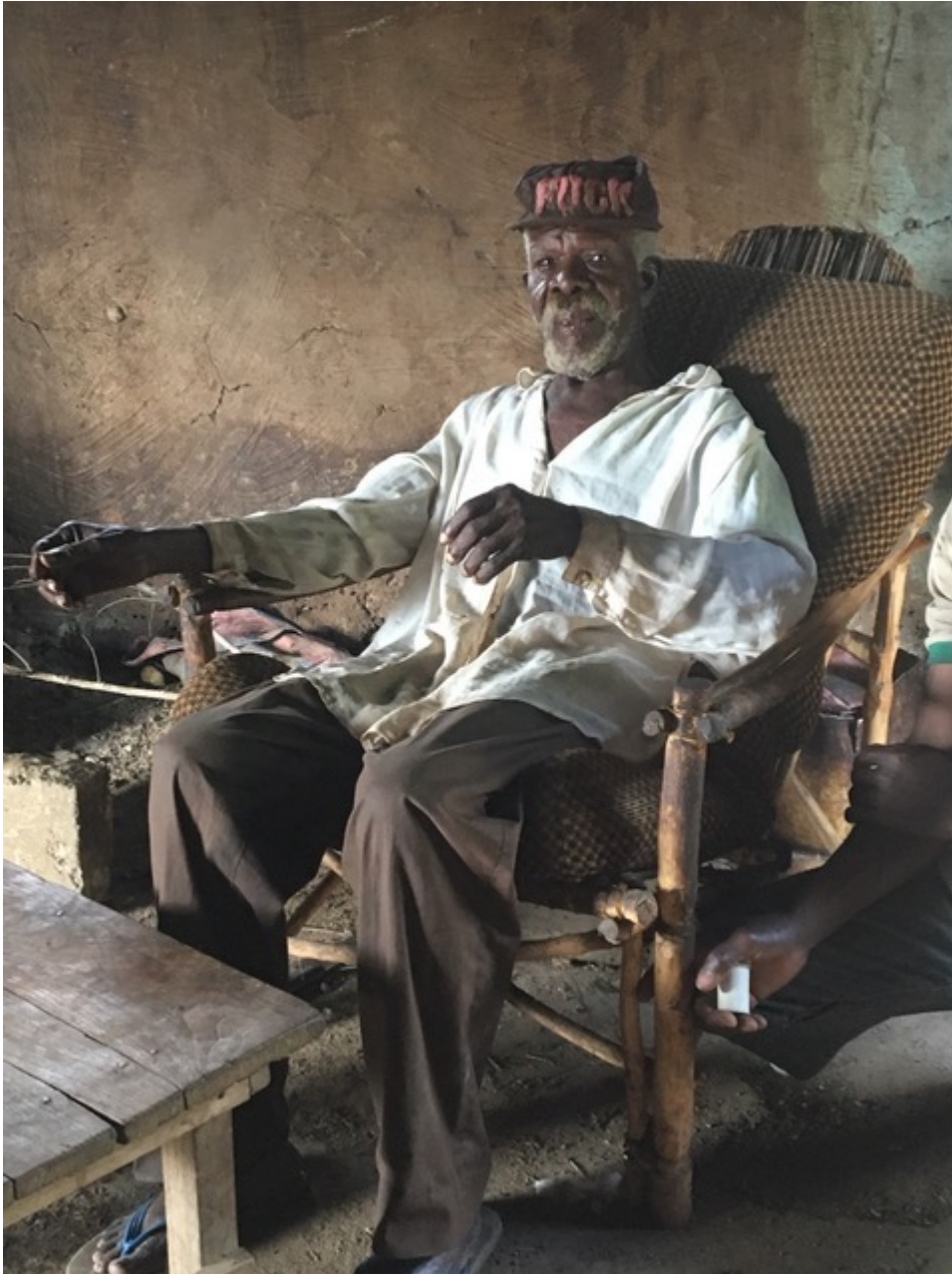
Fig. 7: An old Konkomba.

How can these accounts be heard? And, if it should turn out that ethnographic museums, the main holders of colonial collections, could indeed become appropriate sounding board – what kind of structural reforms would have to be undertaken, what operations of decentralisation and decolonization would have to be carried out so