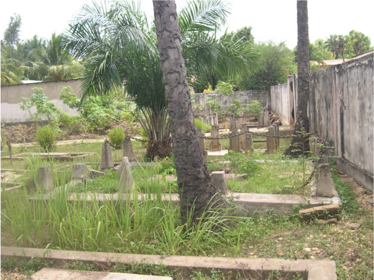
Fig. 6: The broken chains of the European cemetery of Sokodé, capital of the province of Centre and the prefecture of Tchaoudjo.