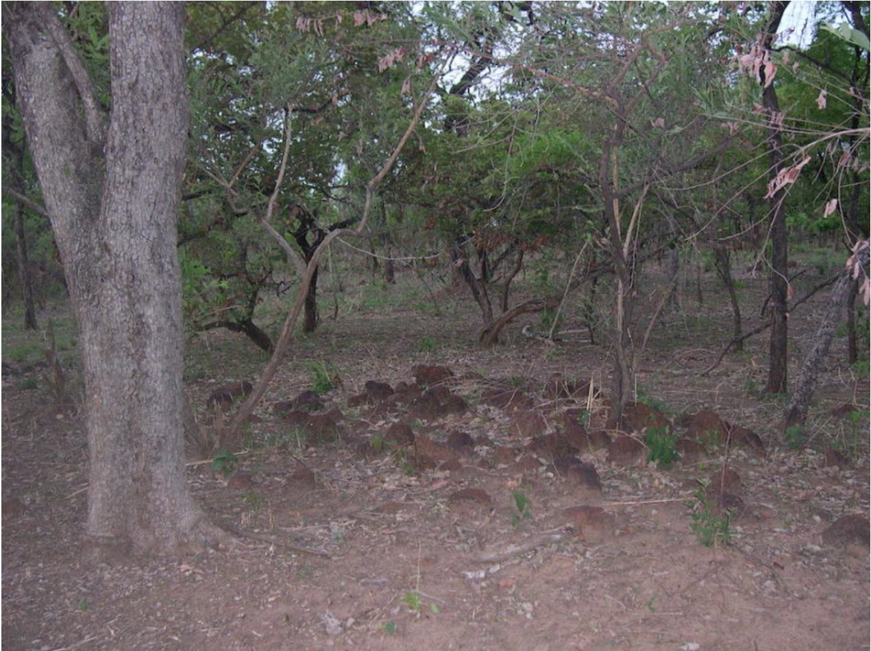
Fig. 3: Iboudjo Cemetery, Dankpen (the site was presented to me as the final resting place of Konkomba archers killed in combat with the German militia).

These, in turn, would give rise to the negotiations for the territorial formation of the German Togo. Despite his doctorate in philosophy, he published surprisingly little about Togo, where he lived almost uninterruptedly from 1892 to 1914. He would never publish his travel journals in his own lifetime, indeed, it was not until 1997 that these were edited under the title Vormarsch zum Niger: Die Memoiren des Leiters der Togo-Hinterland-Expedition 1894/1895 . The memoirs provide detailed documentation of the methods and means used by the Germans in the conquest of the Togo hinterland from 1894 to 1895. There is no mention of amputating thumbs.