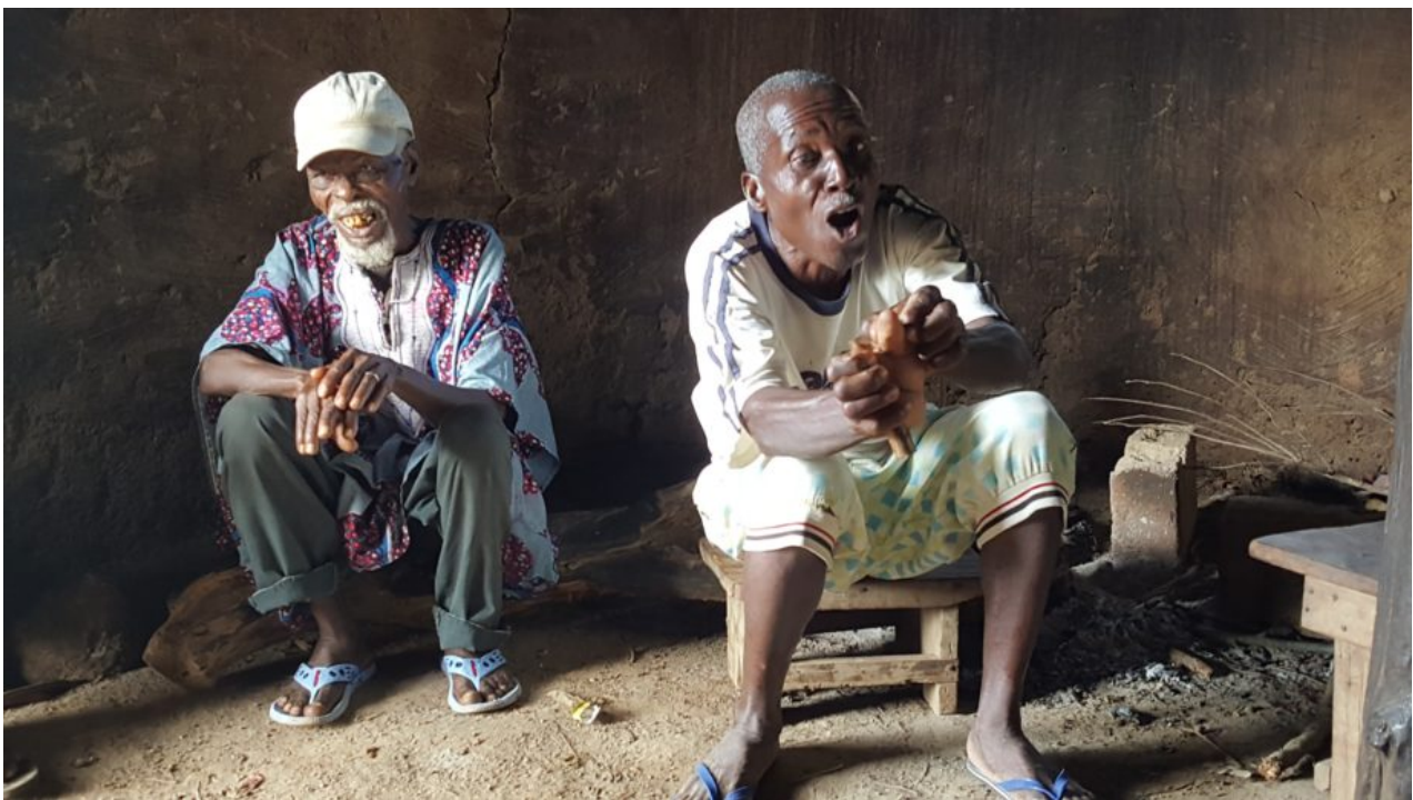
Fig. 1: A Bapuré elder showing how and why Konkomba archers' thumbs were amputated by German militias in the colonial period.

territory in 2006, then again in April, and finally July of 2018. Though I did, I believe, find evidence tending to confirm the reality of this practice, my research – which is still ongoing – revealed certain surprising and disconcerting ways of retelling colonization. In this paper I argue that the debate on the restitution of looted objects cannot take place without taking into account the symbolic trauma engendered by colonization. Restitution, then, ceases to be simply a problem of museum conservation. As this specific story from Togo, which is part of my own biography, shows, the restitution debate is situated in a narrative knot which is currently precisely in the process of being unravelled. Can or should the museum be the place where these stories are transmitted? If so, what status should be given to these accounts and how should they be transmitted?