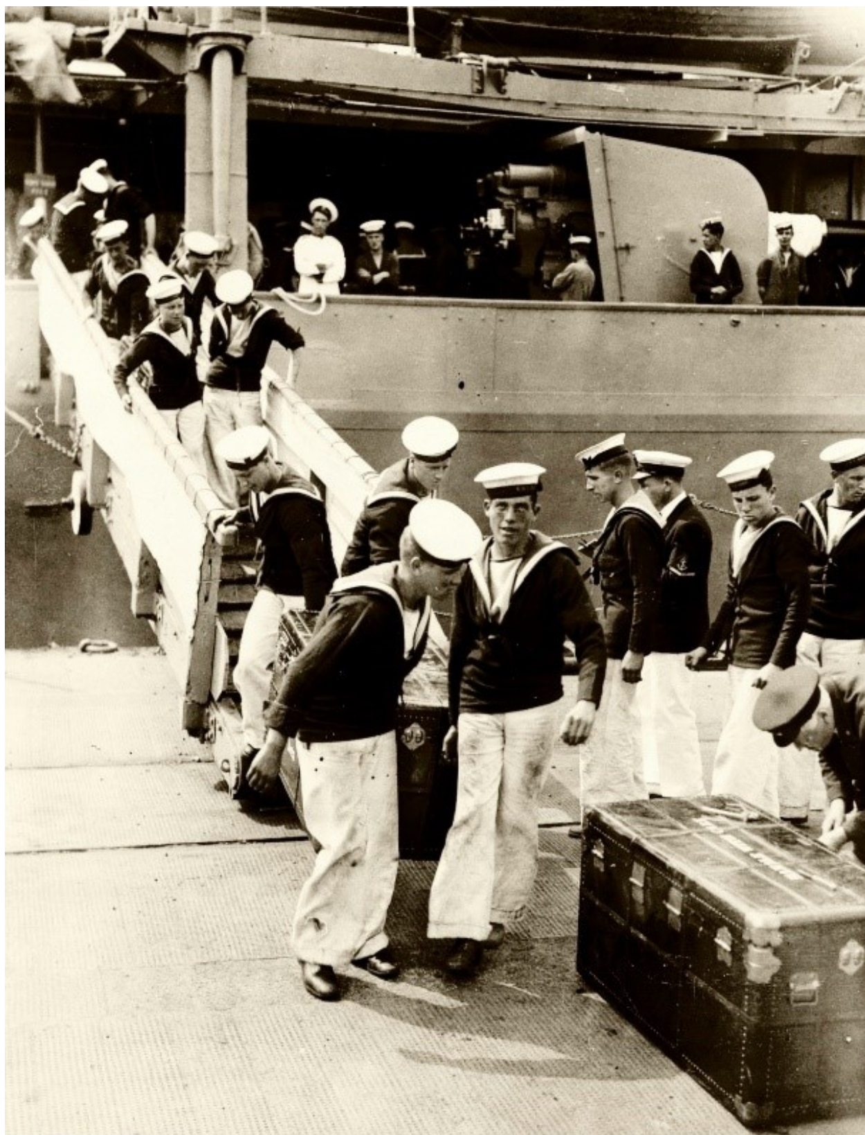
Archives Research on Chinese Government's Preparation for the 1935 Royal Academy International Exhibition of Chinese Art https://boasblogs.org/de/dcntr-debates/debate-2/archives-research-on-chinese-governments-preparation-for-the-1935-royal-academy-international-exhibition-of-chinese-art/