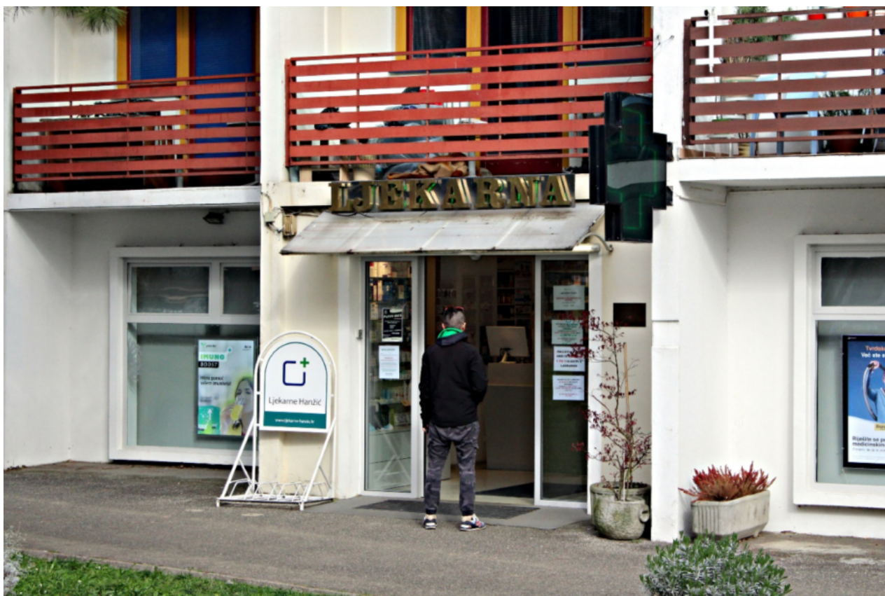
Man waiting in front of pharmacy to be invited – Gajnice, Zagreb