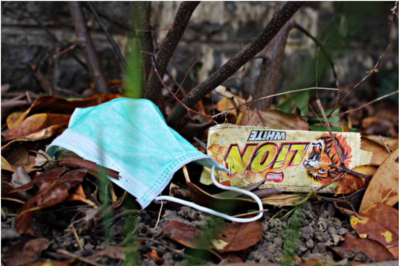
Thrown away mask in Gospodska street in Zagreb

"We are now living in a disaster movie and it just begins."