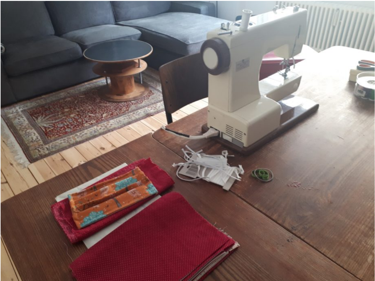
Sewing facial masks in our living room.

At night, a video conference with my sister, mother and her husband. My sister and her husband have been completely isolated for almost a month now, from the moment schools and kindergartens closed. My sister might have to start working again in the following week (first in Cologne and then in Vienna) and is still clueless what to do with her two children while being away (my mom often used to babysit them). My mother's husband is back to work in Cologne. He tells us about revised screenplays and the new hygiene regulations at the film studio. I wonder what the films shot during the next few weeks (and months?) will look like, with all actors