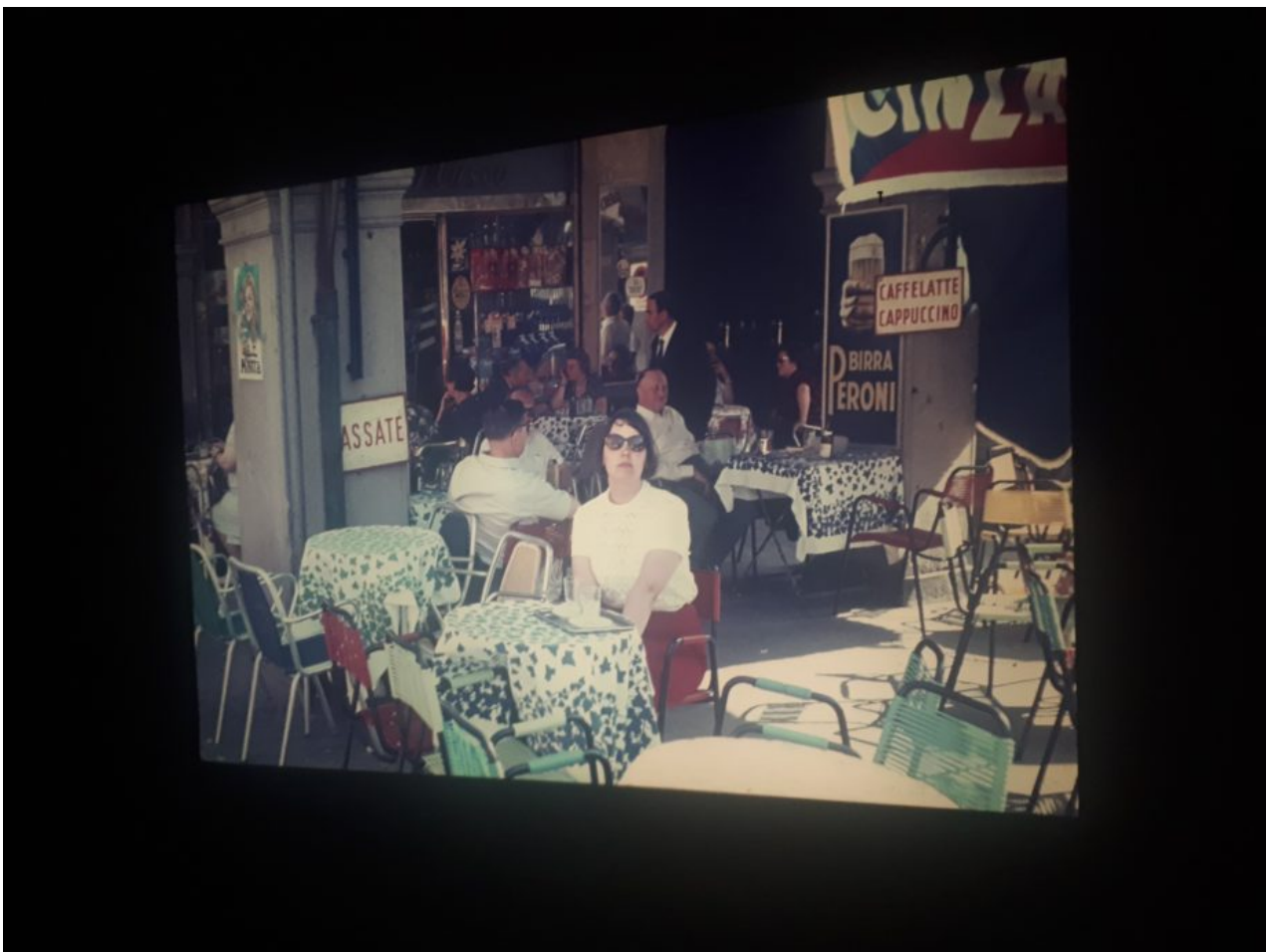
Watching slides of past journeys, here to Venice in the late 1960s.

and I want to select some for digitalization. Watching slides from my parents' journeys to Austria, southern Tyrol, and Italy in the late 1960s, we miss travelling. We tell Meira that once the epidemic is over we will take her to Rome. We think of my mother's house in the Marches that stands empty these days and wonder whether we will be able to go there during the summer as we usually do.