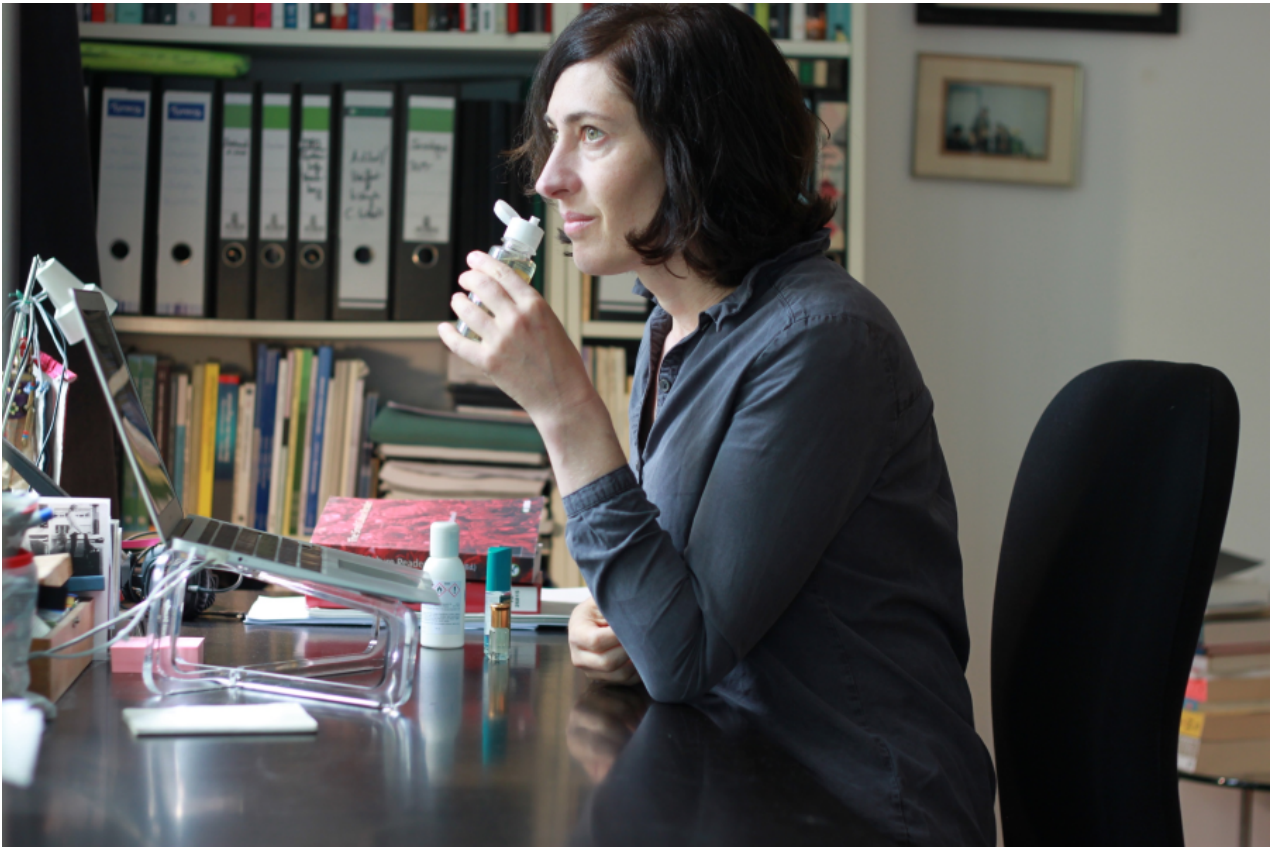
The author at her home office desk.