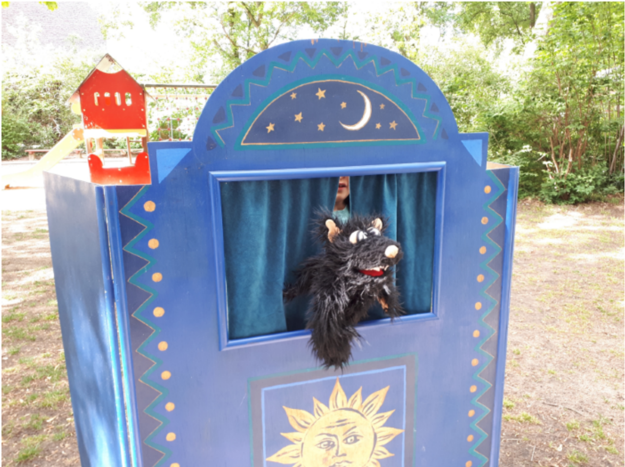
Vielfraß, the Wolverine, in a play yet to be written.