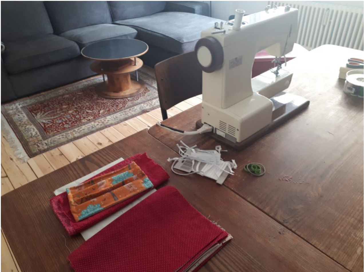
Sewing facial masks in our living room.

At night, a video conference with my sister, mother and her husband. My sister and her husband have been completely isolated for almost a month now, from the moment schools and kindergartens closed. My sister might have to start working again in the following week (first in Cologne and then in Vienna) and is still clueless what to do with her two children while being away (my mom often used to babysit them). My mother's husband is back to work in Cologne. He tells us about revised screenplays and the new hygiene regulations at the film studio. I wonder what the films shot during the next few weeks (and months?) will look like, with all actors