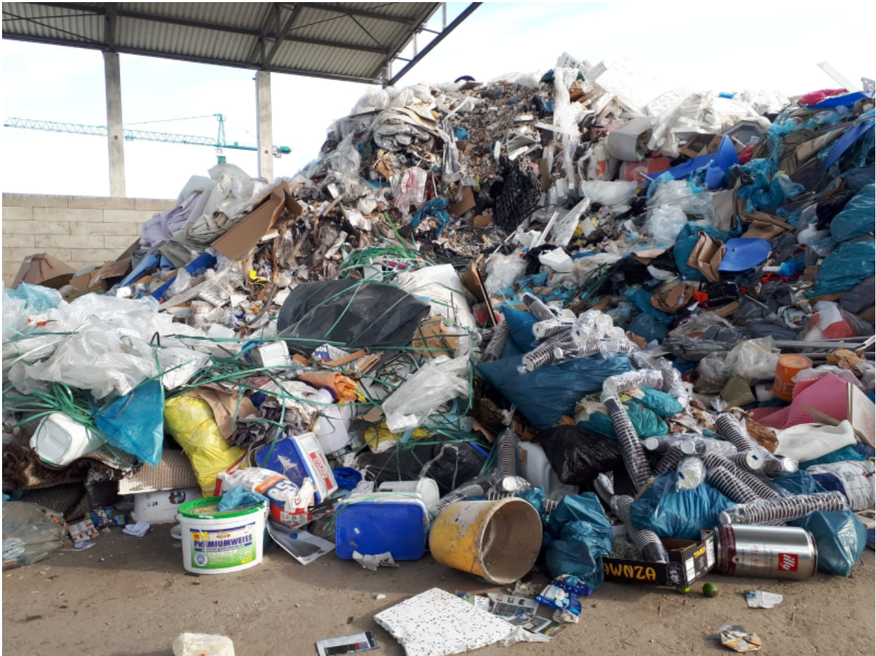
Finally, a place to unload rubbish.