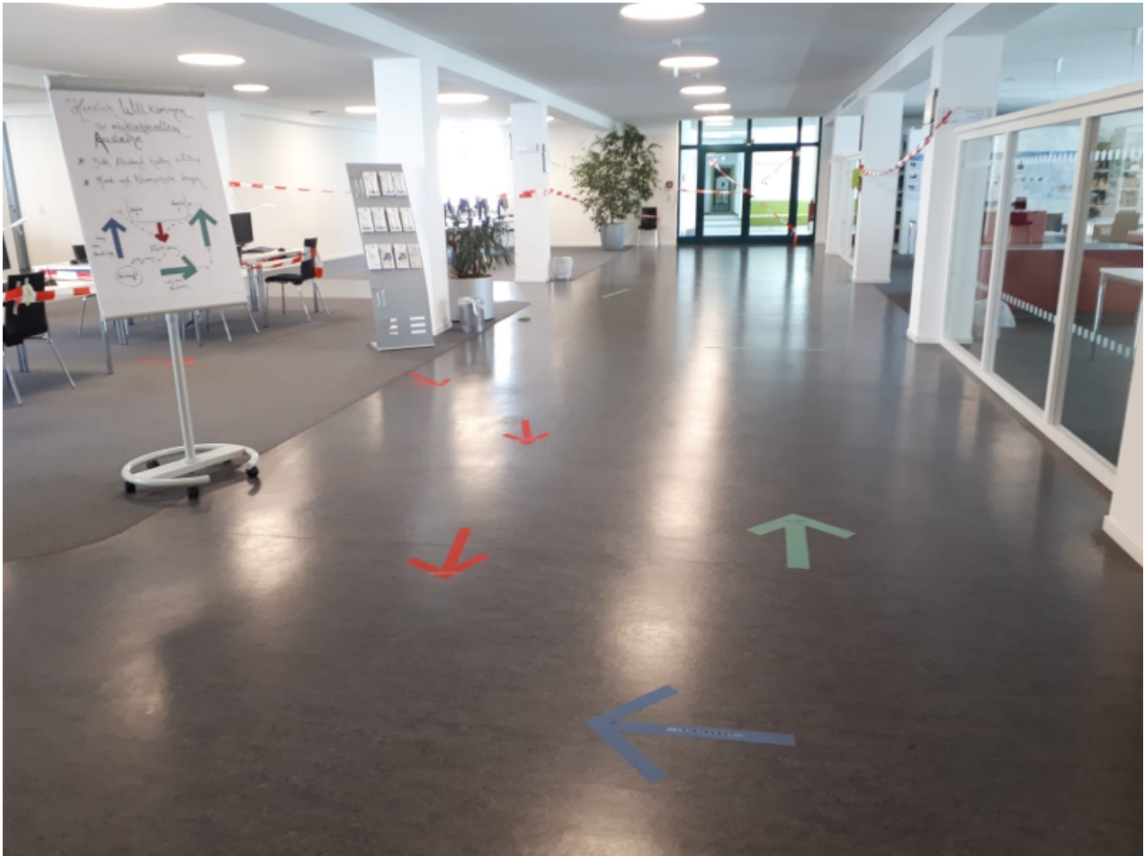
Following the arrows in the Berlin's Free University's Central Library.