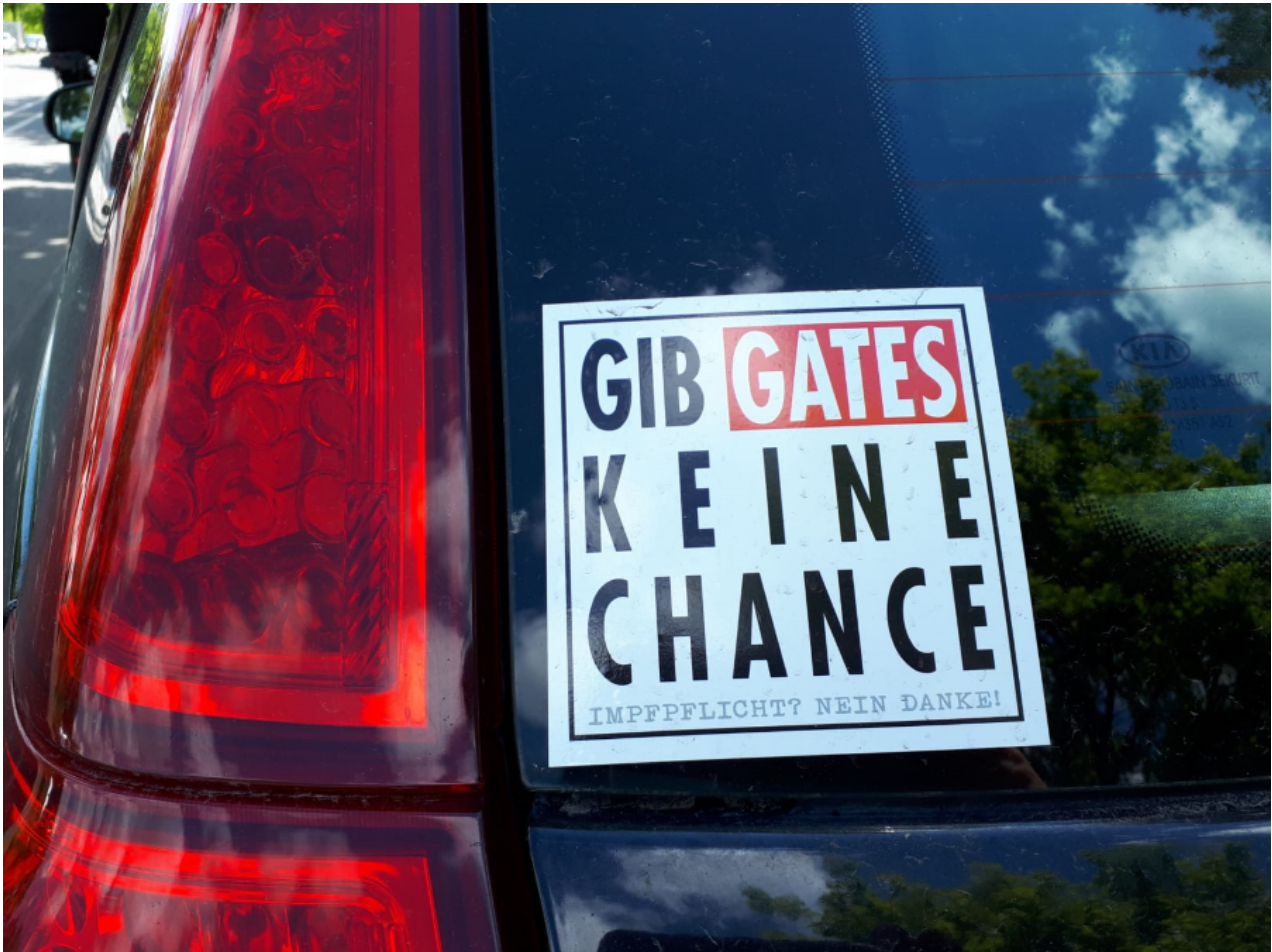
Anti-Gates sticker on the back of a car in Berlin in early May.