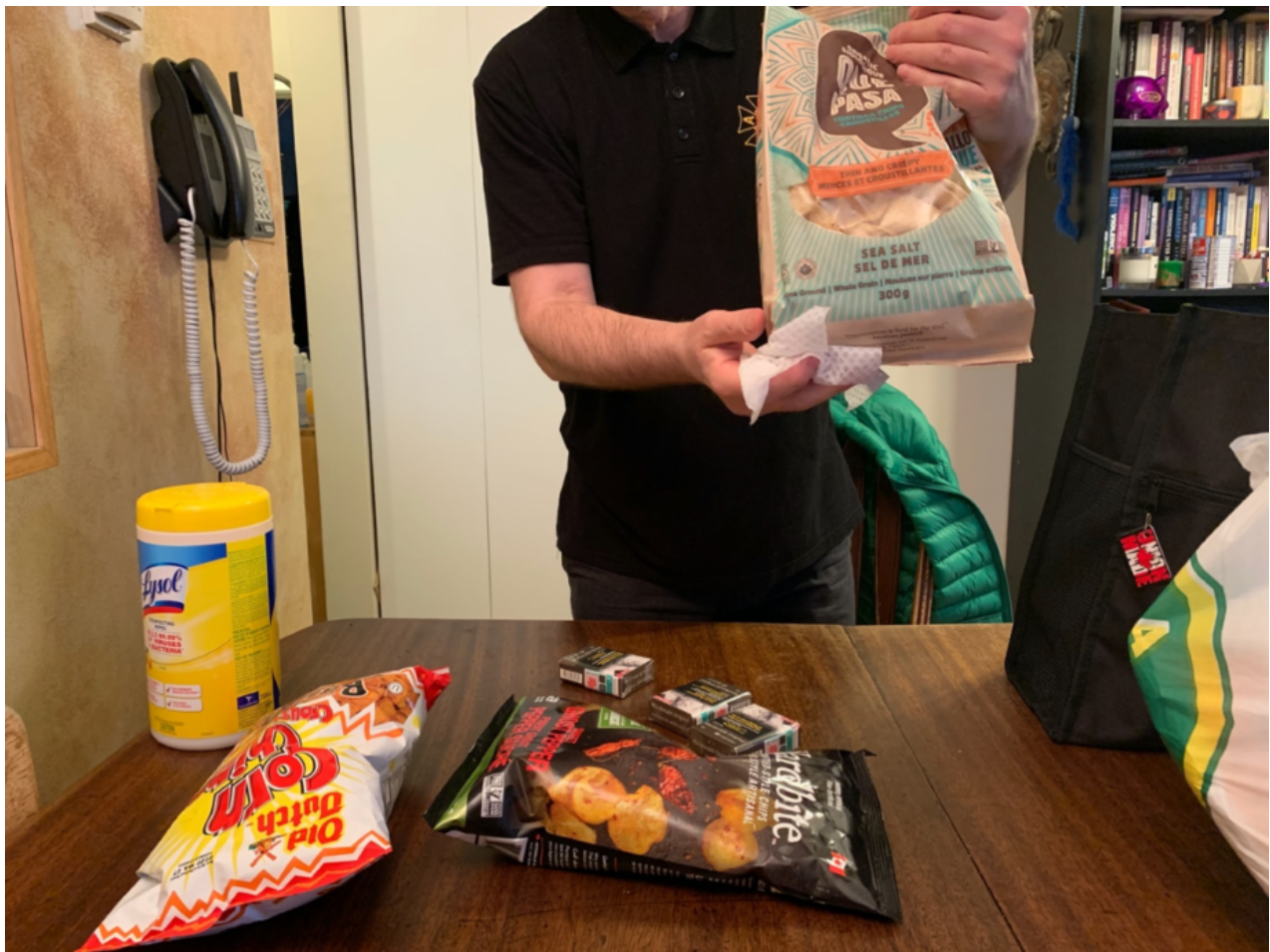
Wiping groceries with disinfectant wipes.

back, and disinfecting all items, took nearly 3 hours. Buying groceries has become a significant task.