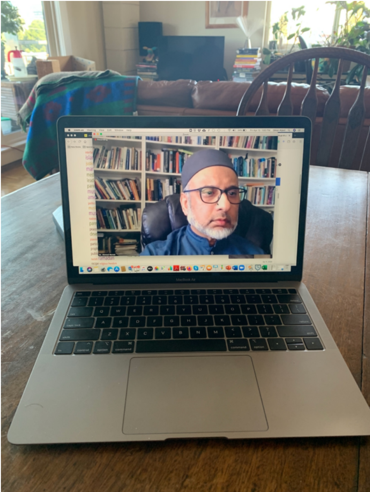
„Mom! Dad! Wash your hands.“ https://boasblogs.org/de/curarecoronadiaries/mom-dad-wash-your-hands/