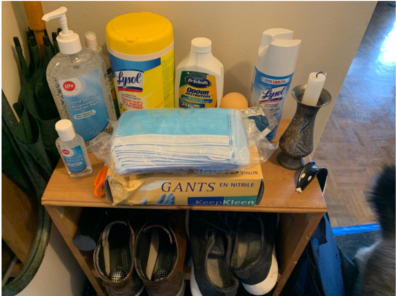
The corona shrine.