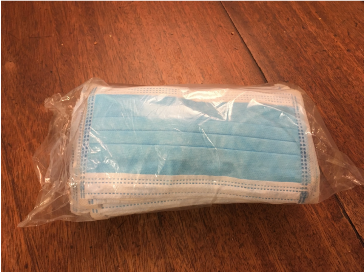
Newly arrived surgical masks ordered from Walmart.

them on the dining table, still slightly uncertain about using them.