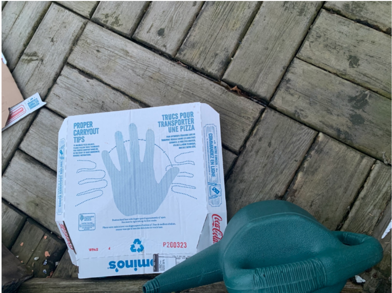
The pizza box “airing” out on the balcony.