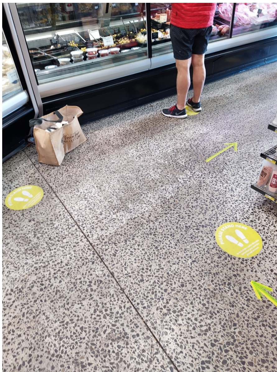
Image: Fyshwick Markets, Canberra ACT on Saturday April 4, 2020.