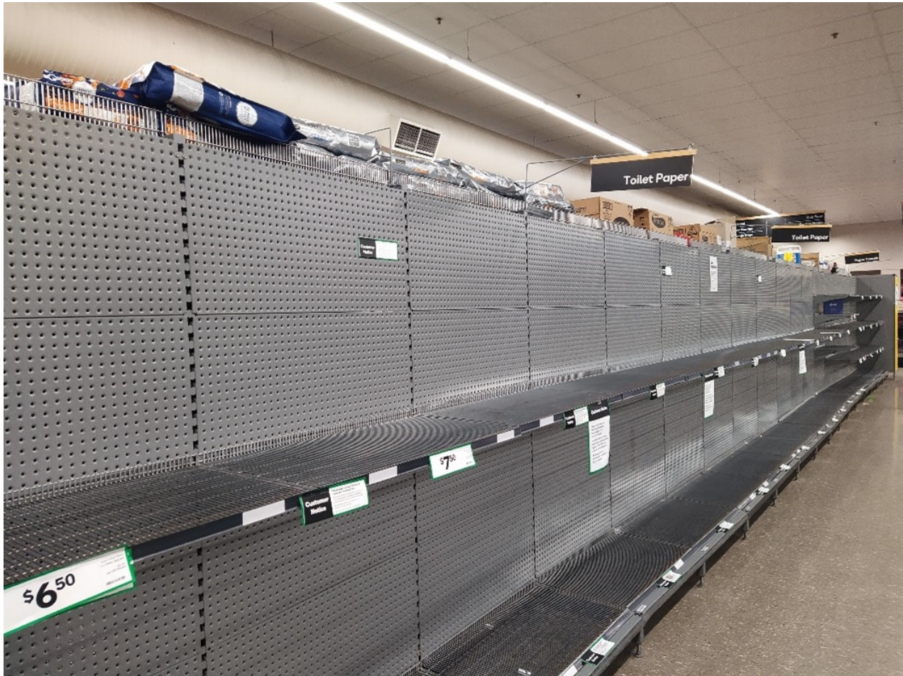
Supermarket in Canberra, Australia on Tuesday March 24, 2020.

There were signs up in every shop with details of how the virus is affecting them. Woolworths had half a dozen varieties, informing people of limits to the amount of things they could purchase, and reminding them not to get angry at staff. Another one, on the front door, said toilet paper is not available. The cafes all had 'take away only' signs and some of the restaurants are closed entirely. I stood on the unusually quiet corner of Bunda Street and Lonsdale Street, in the middle of Canberra. There was no music coming from Kokomo's, the night club's kitschy neon-pink sign was dead and grey. Italian and Sons says their open for take-away. As I stood taking photos the owner (?) manager (?), an Italian man not much older than me, approached from down the street. "Here, take one [a menu]. You can still get take