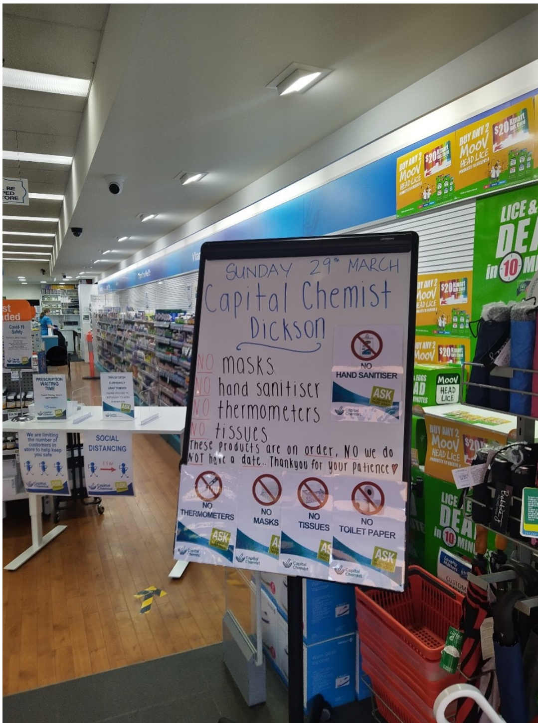
Image: Pharmacy in Canberra, Australia, on Sunday March 29.

New restrictions are coming so fast I can't keep up. And, perhaps more honestly, I