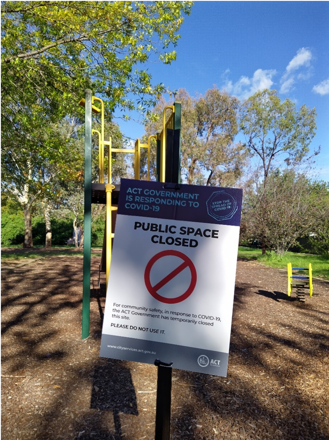
Image: A children's playground in a park in Canberra, Australia on Wednesday April 8, 2020.

"I thought nothing would be worse than those bushfires."