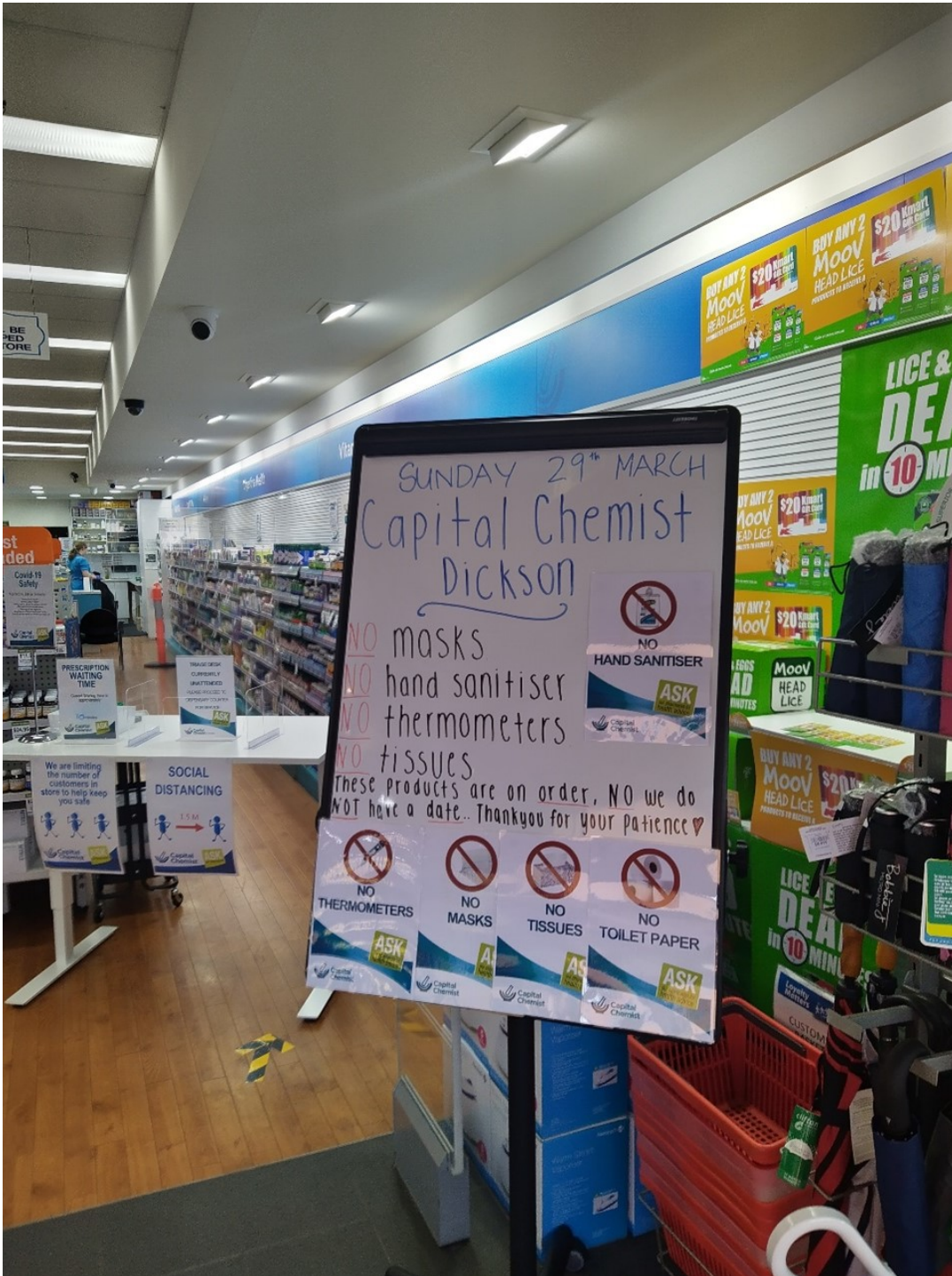
Image: Pharmacy in Canberra, Australia, on Sunday March 29.

New restrictions are coming so fast I can't keep up. And, perhaps more honestly, I