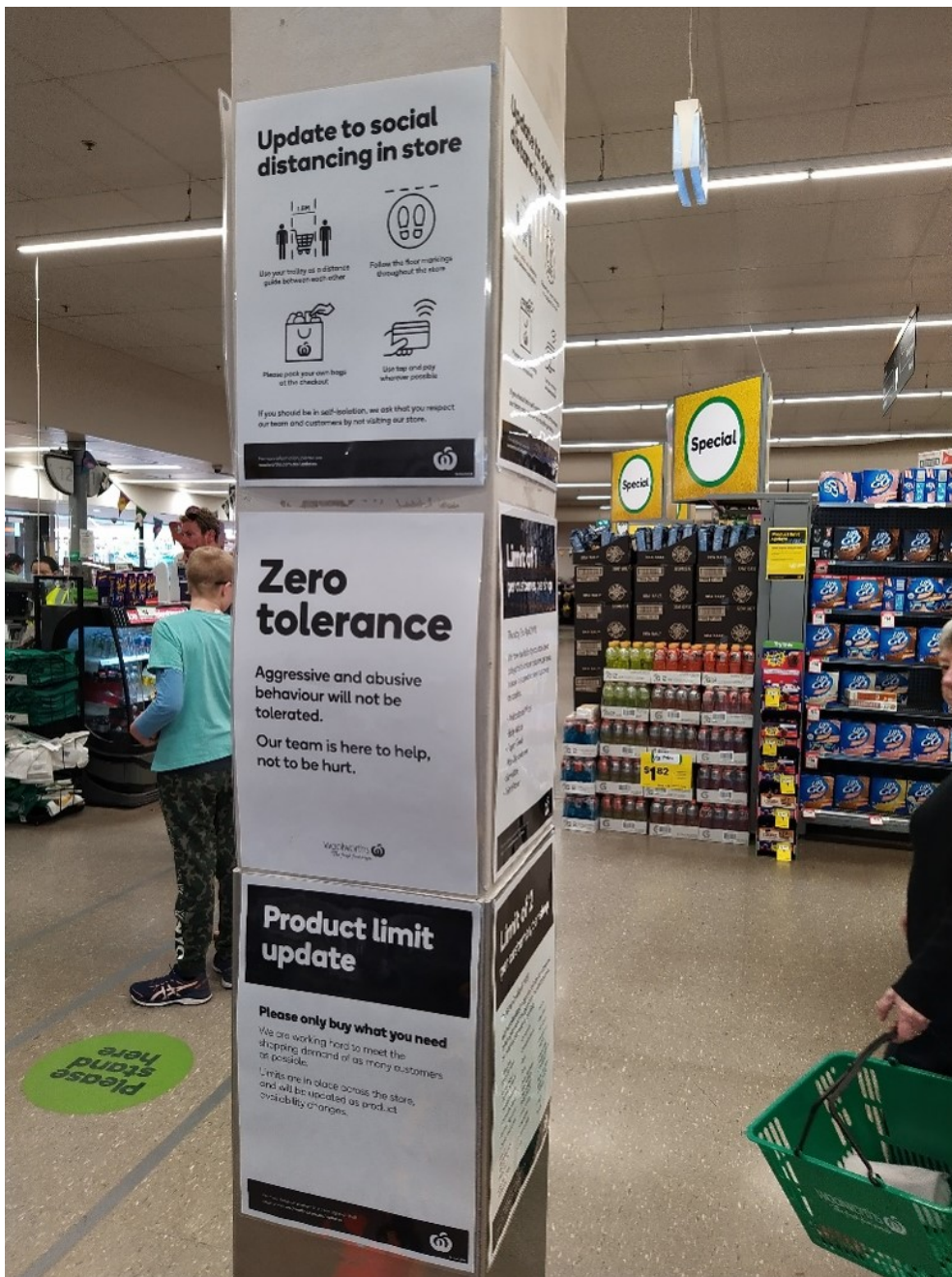
Image: A supermarket in Canberra, Australia on Wednesday April 8, 2020.

I went to Woolworths, which gets more intense with every visit. They have just one door open to enforce restrictions on how many people are allowed in at a time, and witches hats set up where you have to line up (although I didn't have to, probably