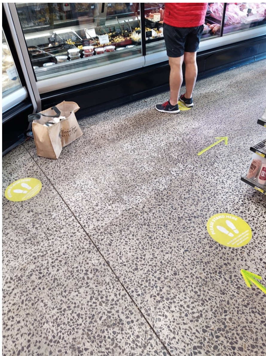
Image: Fyshwick Markets, Canberra ACT on Saturday April 4, 2020.