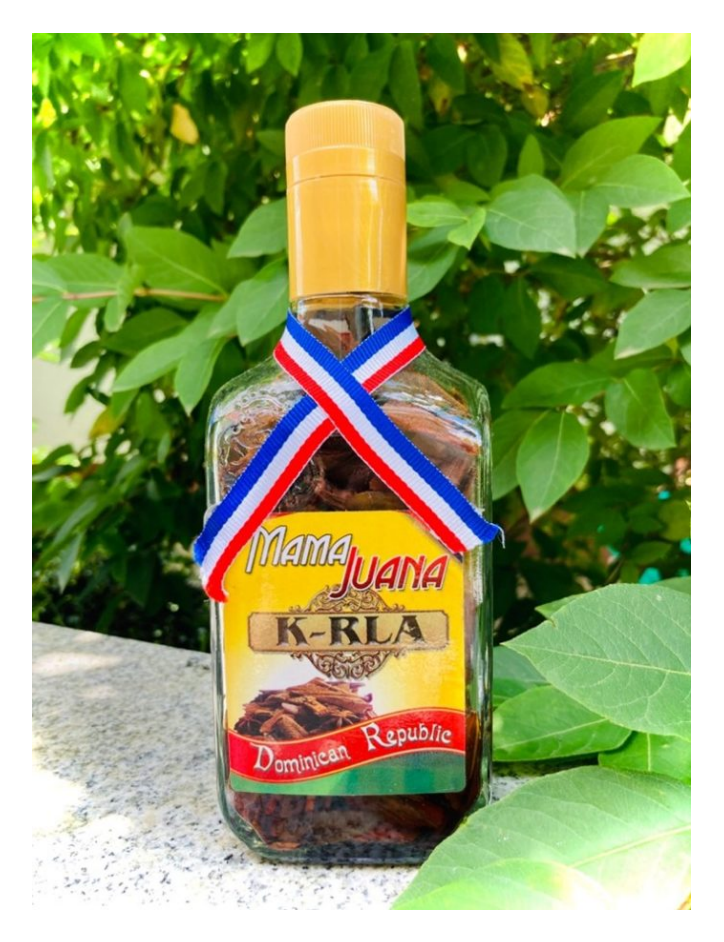
Mamajuana - Dominican drink