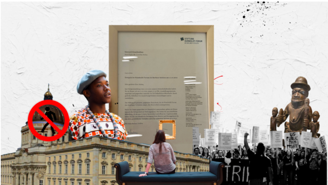
Figure 5: Collage made by the author for this blog entry. Copyright Wan wo Layir.

Other lessons abound and we shall discuss them in due time and through other experiences within and outside the walls of this splendid palace of horror where we go to die, next to our cultures buried in mass glass graves.