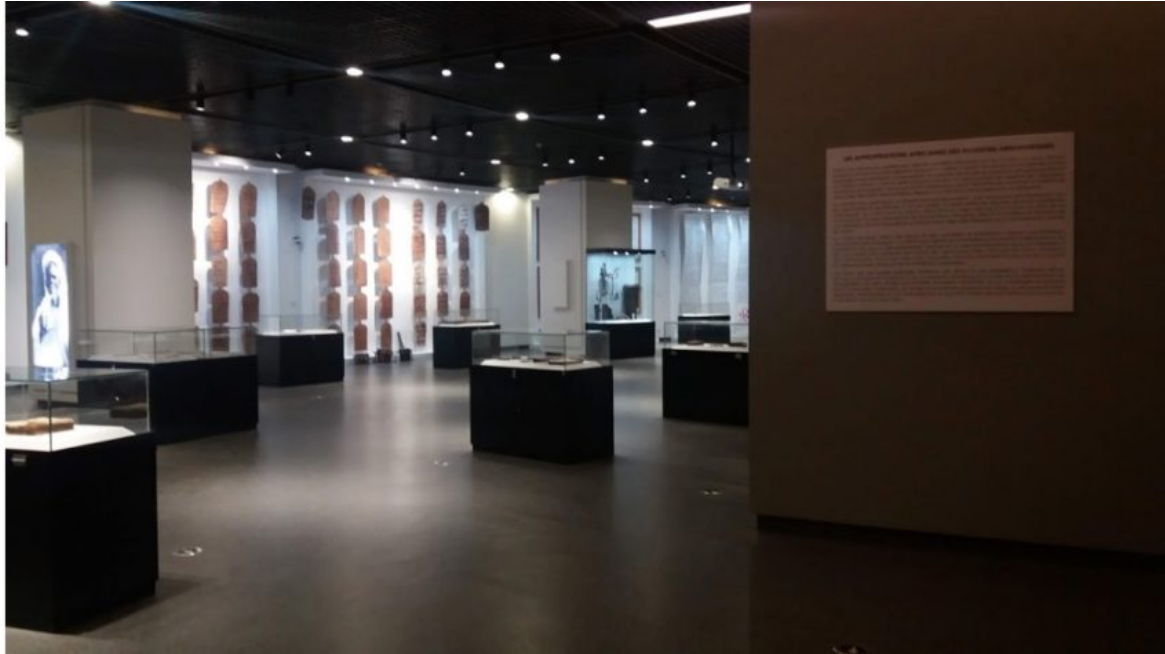
Fig. 6: Maintenant l'Afrique Installation shot, Musée des civilisations noires (Dakar 2019).