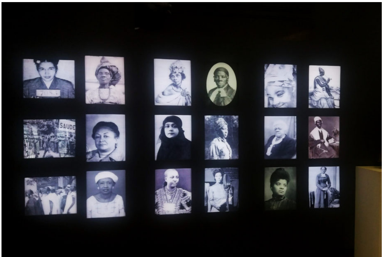
Fig. 4: Les Lignes de Continuité and Femmes Noires et la Production des Savoirs Installation shots, Musée des civilisations noires (Dakar 2019).

perspective and in the longue durée , and was exhaustively discussed by a number of stakeholders in 2016 during the International Planning Conference of the Museum of Black Civilizations (Conférence Internationale de Préfiguration du Musée des Civilisations Noires). In attendance was historian and dean of the Cheikh Anta Diop University (Dakar) Ibrahima Thioub (2016: 13), who affirmed that »[...] humankind owes an immeasurable debt to Africa.« Indeed, the MCN opening galleries are a powerful statement in light of the continent's position in the history of modernity, the transatlantic slave trade, and neoliberal capitalism. What follows however, is a missed opportunity to confront this positioning with Souleymane B. Diagne's (2019; 2020) idea of a mutant museum.