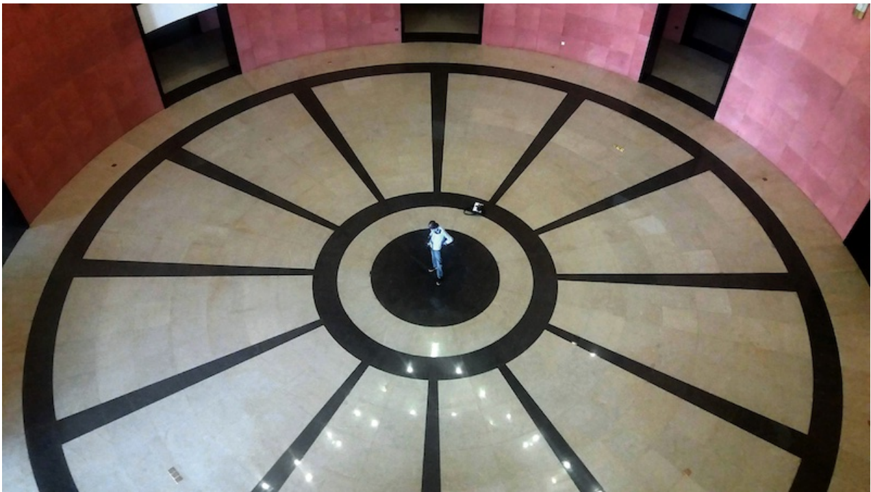
Fig. 2: Atrium of the Musée des Civilisations Noires (Dakar) three months before its opening (September 2018).

As in the 1970s, the idea of a cultural park guided the ensemble of facilities retaken during Abdoulaye Wade's mandate. Broadcasted on national television, the new constructions were dubbed the Seven Wonders of Dakar. In addition to the MCN, the project featured a new national theatre (opened in 2011), a national library, the national archives, a museum of contemporary art, the school of fine arts, the school of architecture, a music palace and the legendary statue entitled Monument de la Renaissance Africaine (Monument of African Renaissance) [5] »They are wonders in the sense that through their architecture and their meaning, they transmit messages through time to future generations« said Wade ( apud Drame 2011).