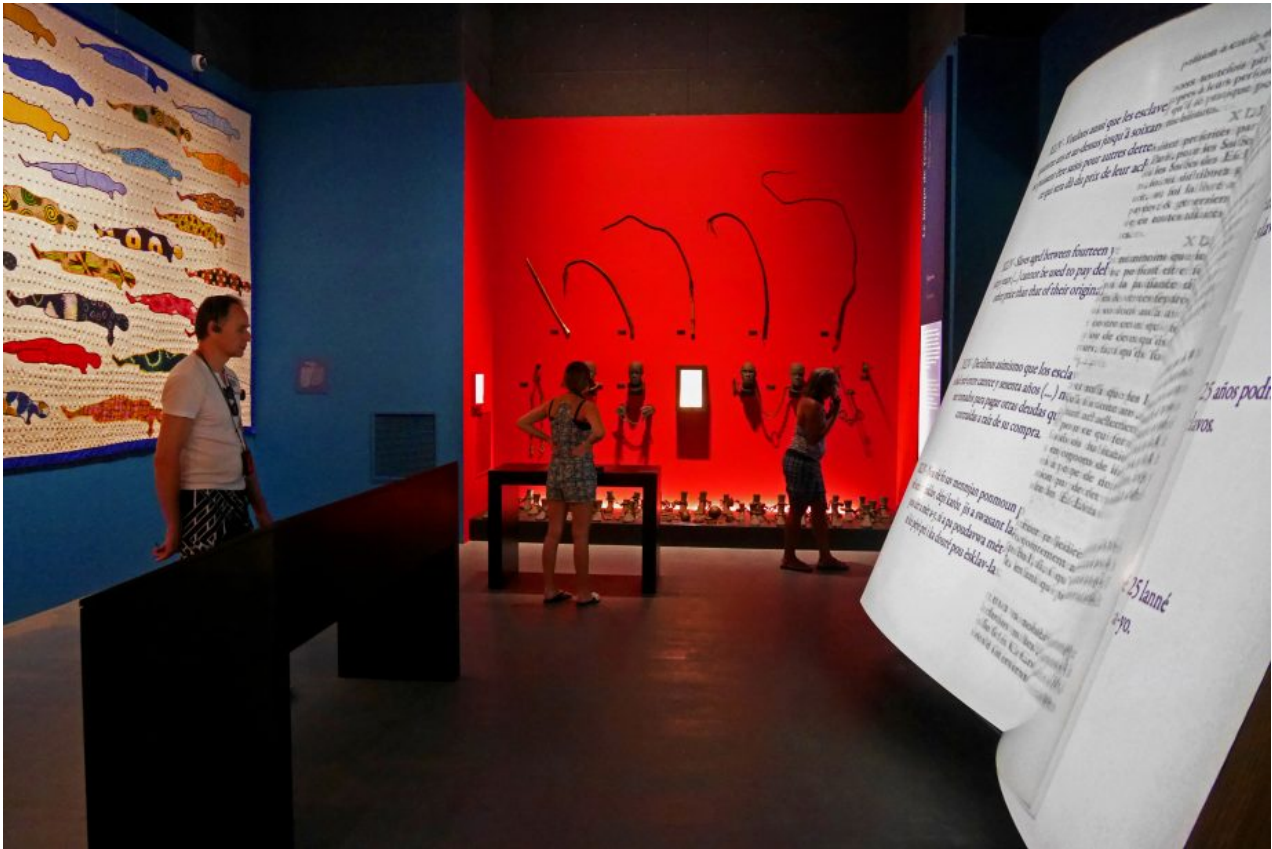
Whips, chains, shackles – and an oversized copy of the infamous “Code Noir”. For documentation purposes reproduced from: www.agence-explosion.com

While walking through the exhibition, in spite of the shackles and chains, the system of slavery in the colonial plantation society acquires an awkward sense of normalcy. An ambience of “ Such were the times! ” is cultivated – for instance when we read that “slave penal law (...) in terms of corporal punishment, was similar to military law applicable to soldiers” (p. 154). Many of the engravings, drawings and paintings on display reinforce this normalization. They are essentially decorative, presented without a contextualization of the source. The idyllic depictions of sugar harvesting on the island of Antigua by William Clark are shown without any mention that the artist was a plantation overseer himself. Even outright visual propaganda, such as the engravings of Haitian rebel slaves massacring French civilians, are reproduced as illustrations with no comment.