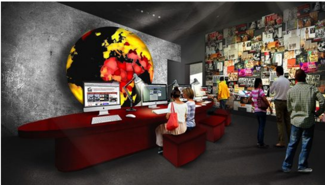
Where slavery persists: The MACTe's room on the challenge of today. For documentation purposes reproduced from: www.esclavage-memoire.com

last room fast-forwards to the present, the pressing issue of today are not persisting racist legacies or socio-economic hierarchies. Instead, an interactive screen maps the ongoing existence of unfree labor in the world. Choosing this perspective provides an easy way out for Europe. Regarding this category, it fares well. The supposed problem-continent, lit in red, is Africa.