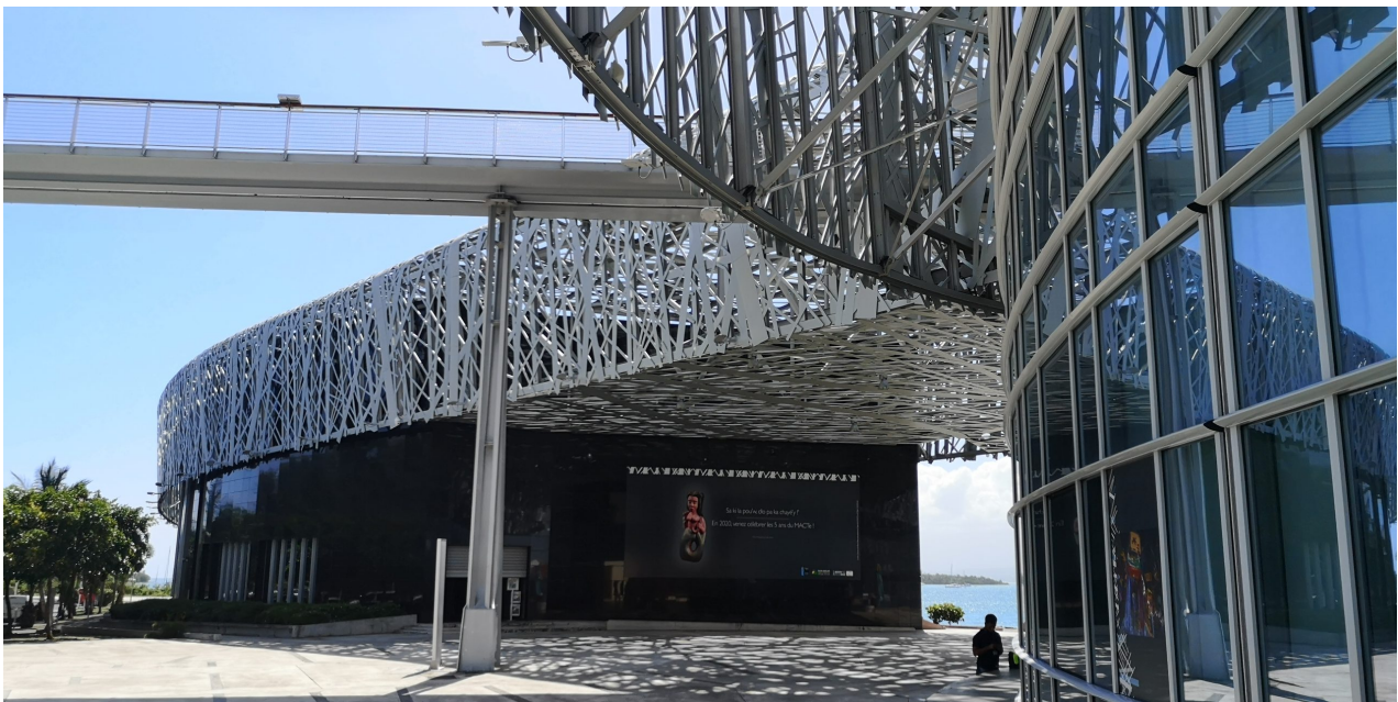
The “Mémorial ACTe” Museum in Pointe-à-Pitre, Guadeloupe.

This building is a statement. When you enter the port of Pointe-à-Pitre, the capital of the Caribbean islands of Guadeloupe, you do not see an imposing cathedral, a government palace or a stadium. What catches your eye is a museum. A modern structure, covered with a metallic grid evoking tropical trees' aerial roots, stretching for some 100 meters along the port basin. A museum not on some pleasant theme of entertaining nature, but on the most painful wound in the history of any Caribbean community: slavery.