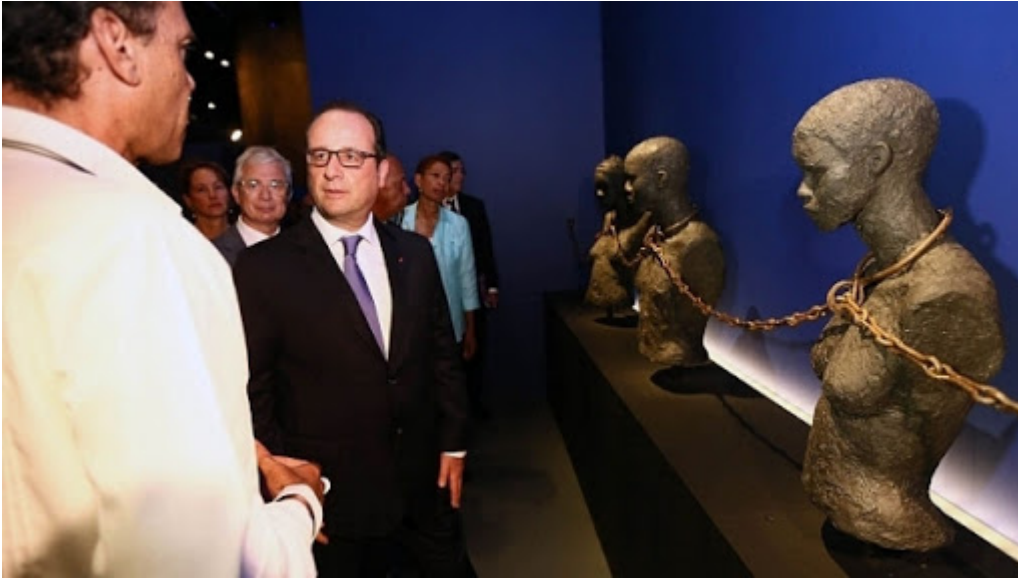
Official press photo showing French President Hollande at the inauguration of the MACTe.

The visitor's irritation continues in the rooms on the practice of slavery in the plantation economies of the French colonies. Not that the exhibition would deny torture and violence. Indeed, a gallery presents the instruments of repression: bullwhips, chains, shackles, iron masks- a dark arsenal of quotidian terror. The trick is in the framing: The same room displays a super-sized version of the Code Noir . This collection of laws and regulations governing the slave system under French rule is a document of bureaucratic monstrosity. Slaves were property but could not be mortgaged. No slave markets were allowed on Sundays. Fugitive slaves absent for a month should have their ears cut off and be branded. And so on, in 60 articles. The audio-guide then presents an unexpected connection between this and the instruments of repression on display: The plantation owners, we are told, used these in spite of the fact that the Code Noir prohibited torture! The French colonial state is portrayed as establishing rules and caring for the protection of the slaves, but, alas, it was unable to reign in the cruelty of the planters.