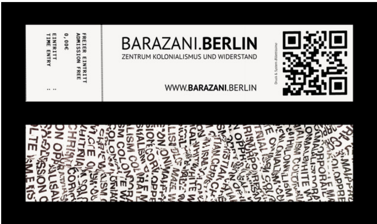
Entrance tickets for BARAZANI.berlin—Forum Colonialism and Resistance.

Another demolition—this time of the Palace of the Republic (built between 1973 and 1976, closed in 1990 and demolished between 2006 and 2008)—is the starting point for Barazani Berlin . The initiators of Barazani (which means ‘forum’ in Swahili) Berlin attempt to go back in time to the empty Schlossplatz , where so much seemed possible in the years between 2008 and 2013, before the laying of the new palace’s foundation stone. By creating and curating a virtual space, Barazani Berlin turns to the past while envisioning a future for their forum—a place of de-colonial cultural and political intervention, resistance and remembrance. The people behind Barazani Berlin (international activists and artists, scholars and curators who have been voicing their critique for many years) see their approach as a way to digitally subvert and question the physical site. As is stated on the project’s website, they consider the realisation of the Humboldt Forum ‘a continuation of the colonial injustice system and making visible its effects on contemporary society’. Brought about by the emergency of the COVID-19 pandemic, the notion of an online space extends a powerful form of intervention far beyond the current situation. The website was launched two days before the Forum’s digital opening. The initiators chose this timing not only to take advantage of the