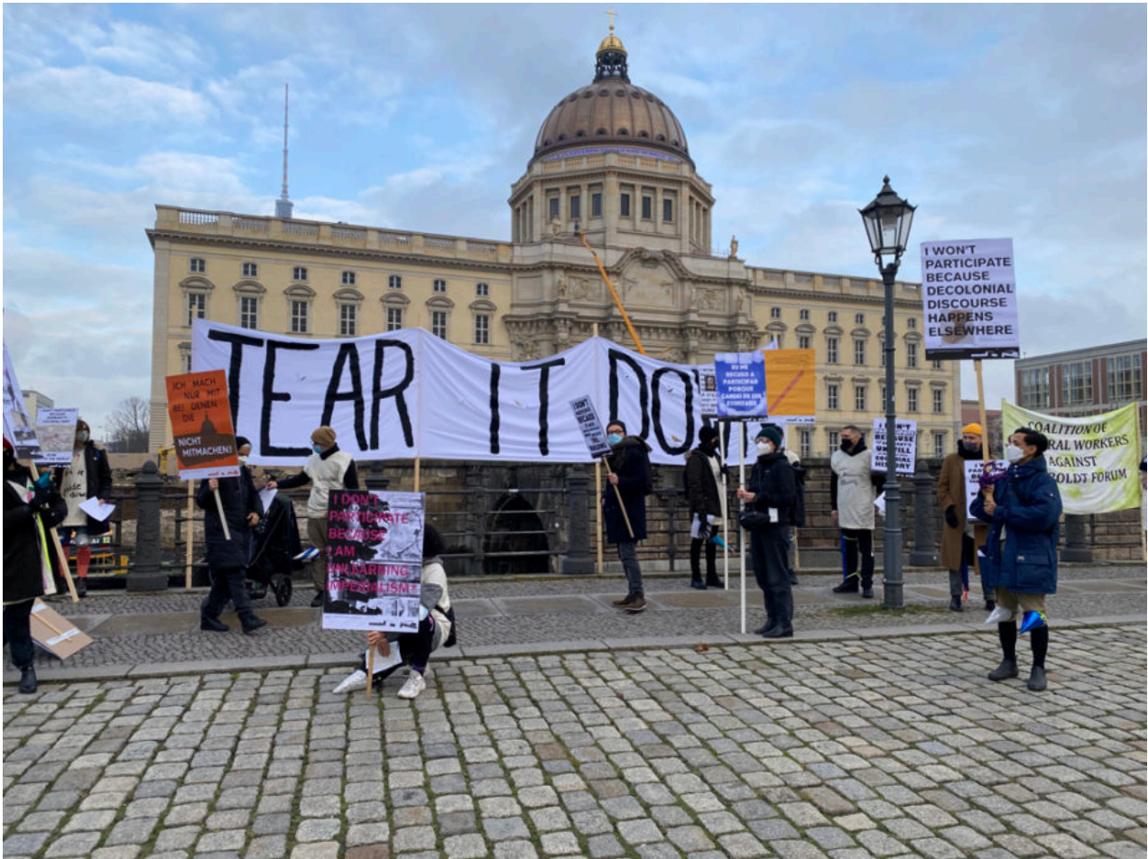
Protest on December 16, 2020 by the Coalition of Cultural Workers Against the Humboldt Forum.

Seizing the moment when public attention was directed at the Humboldt Forum before its opening, and as mentioned earlier, Nigeria's ambassador to Germany, Yusuf Tuggar, reiterated his demand for the restitution of the Benin bronzes, which he made in a formal letter to German chancellor Angela Merkel and minister of state for culture and media Monika Grütters in August 2019. The Ethnological Museum houses more than 400 of the Benin bronzes, which belong to those looted by the British in 1897 during a so-called punitive expedition and subsequently sold at art auctions throughout Central Europe. A selection of the bronzes stored in Berlin will