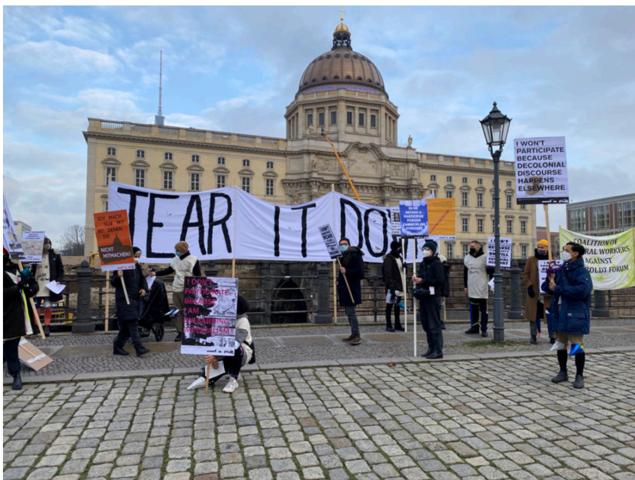
Protest on December 16, 2020 by the Coalition of Cultural Workers Against the Humboldt Forum.

Seizing the moment when public attention was directed at the Humboldt Forum before its opening, and as mentioned earlier, Nigeria's ambassador to Germany, Yusuf Tuggar, reiterated his demand for the restitution of the Benin bronzes, which he made in a formal letter to German chancellor Angela Merkel and minister of state for culture and media Monika Grütters in August 2019. The Ethnological Museum houses more than 400 of the Benin bronzes, which belong to those looted by the British in 1897 during a so-called punitive expedition and subsequently sold at art auctions throughout Central Europe. A selection of the bronzes stored in Berlin will be on display as part of the Ethnological Museum's exhibitions, which are scheduled to open at the Humboldt Forum in late summer 2021. Although attempts for diplomatic discussions have been initiated, neither the German government nor the Prussian Cultural Heritage