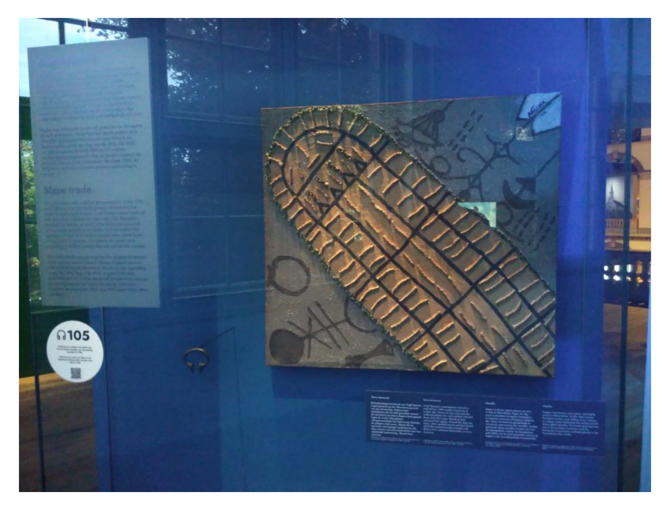
Picture 3: Virgil Nassara's abstract artwork "Terra Inconnue" showing a slave ship

under the pressure to convey specific meanings.