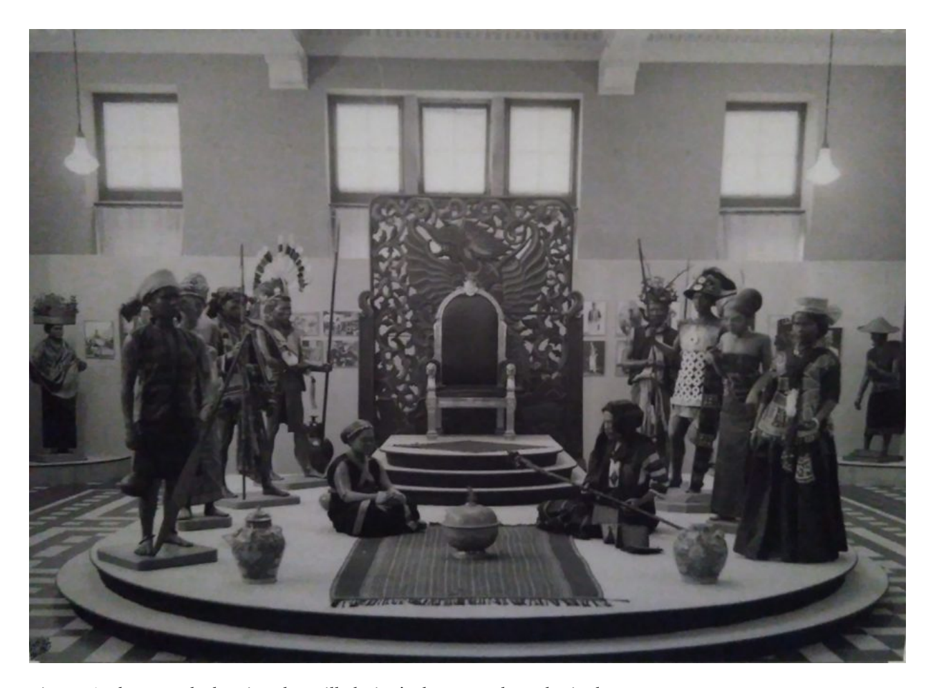
Picture 1: Photograph showing the Wilhelmina's throne at the Koloniaal Museum

Unfortunately, this interaction of different mediums does not always work as successfully. Take, for example, the display case on the Banda Genocide mentioned above. While the text is clear in its content and goal, the choice of objects is not. Next to the text, the visitor finds a botanical drawing of a nutmeg fruit, cloth with a nutmeg-inspired batik pattern and a Dutch etching showing the island of Banda. On the other side of the display case stand a model of a ship and a house made of cloves, a bust of Jan Pieterszoon Coen and a schoolbook illustration of a peaceful plantation. Granted, all these objects have some link to the spice trade and hence to the Banda genocide. But none of them seem to provide any additional information, nor do they offer ways to approach the genocide emotionally. To me, it feels like the curators