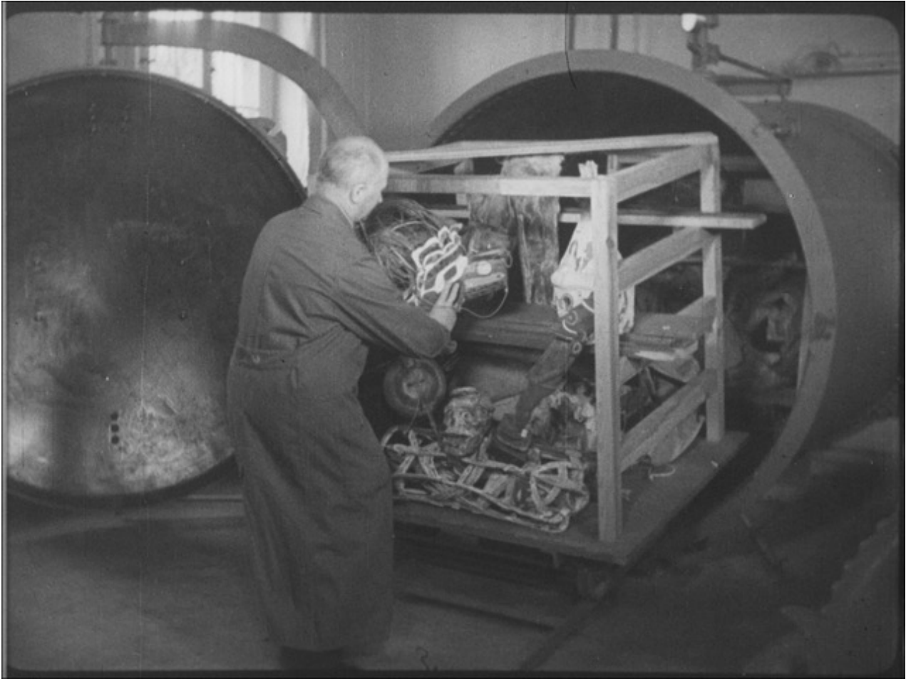
Fumigation system at the Staatliches Museum für Völkerkunde zu Berlin, closed condition, 1923.

Chapter 3 zooms in to the introduction of chemical treatments at the Ethnological Museum Berlin. Tello retraces how, in the decades of Germany's expansionist colonial politics between the Berlin conference 1884 and the end of World War I, colonial collecting led to the rapid expansion of museum storage, transferring thousands of objects in different climatic conditions, narrow spaces, managed by museum staff that was often overburdened with the masses of artefacts. In these conditions, organic materials such as wood, plant fibers, hide, leather, feathers, and textiles were frequently exposed to insects, rodents, humidity and mold. Chemical substances were introduced in the collections in search for efficient means to