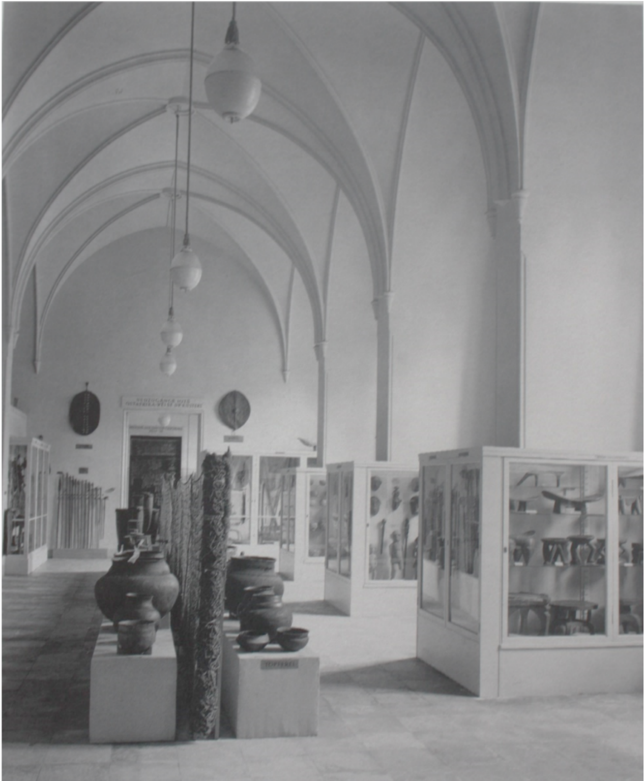
Exhibition “Collection East Africa Expedition Dr Küsters” (1929), Ethnographic