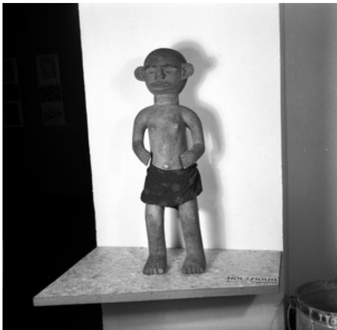
Exhibition “African Art”, Amerika-Haus, Munich 1953; Photograph: Felicitas Timpe, Picture Archive Bayerische Staatsbibliothek, CCO 1.0

objects were classified, catalogued, and stacked in the museum depots – after having been presented to the public in a grand, if rather unsystematic exhibition in 1929. The wooden sculptures alone resurfaced in several exhibitions as “African art” during the second half of the 20 th century.