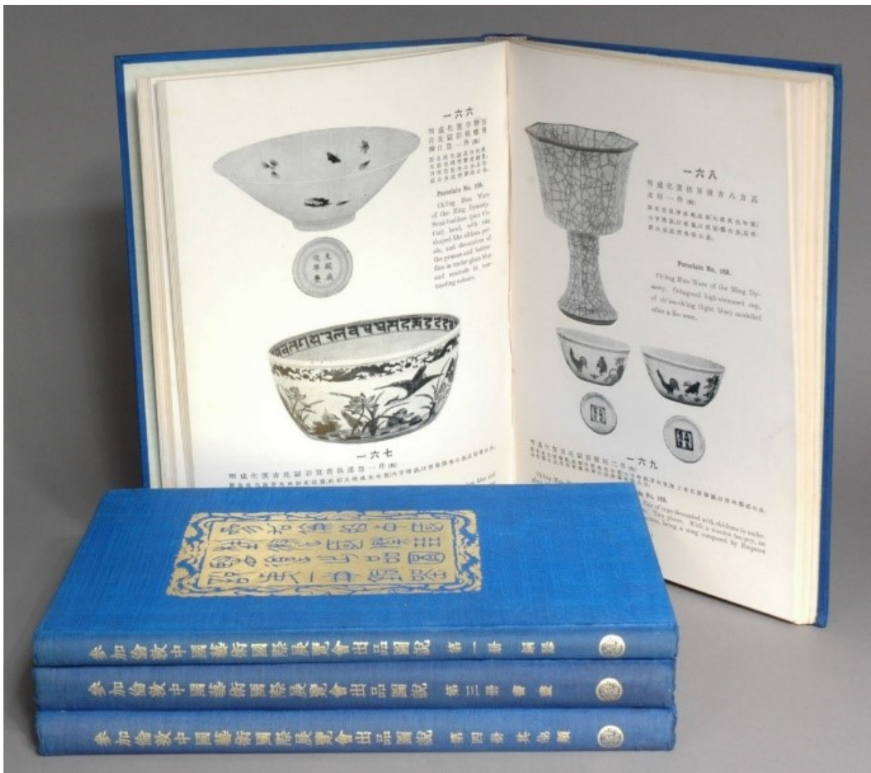
Fig. 4-5: Catalogues of the Exhibition from Britain and China.

Other materials that I consulted include The Catalogue of the International Exhibition of Chinese Art and the Illustrated Supplement published by the RA and the Illustrated Catalogue of Chinese Government Exhibits for the International Exhibition of Chinese Art in London published by The Commercial Press under the commission of the Government of China. The latter catalogued the artworks that participated in the Shanghai Pre-Exhibition from 8 April to 5 May 1935 in four categories: bronzes, porcelain, painting and calligraphy, and miscellaneous. The archivist of the Second