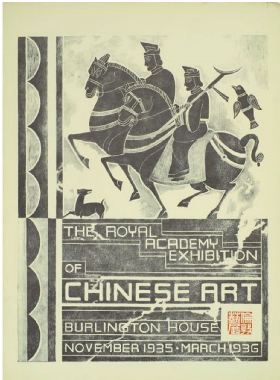
Fig. 1. The Poster of the 1935 International Exhibition of Chinese Art.

The International Exhibition of Chinese Art (hereinafter 1935 Exhibition) was held at Burlington House, London, from 28 November 1935 to 6 March 1936. [4] As “one of a sequence of national art shows” at the Royal Academy of Arts (hereinafter RA) and the annual winter exhibition of the RA, 3,078 Chinese artworks in all genres lent by