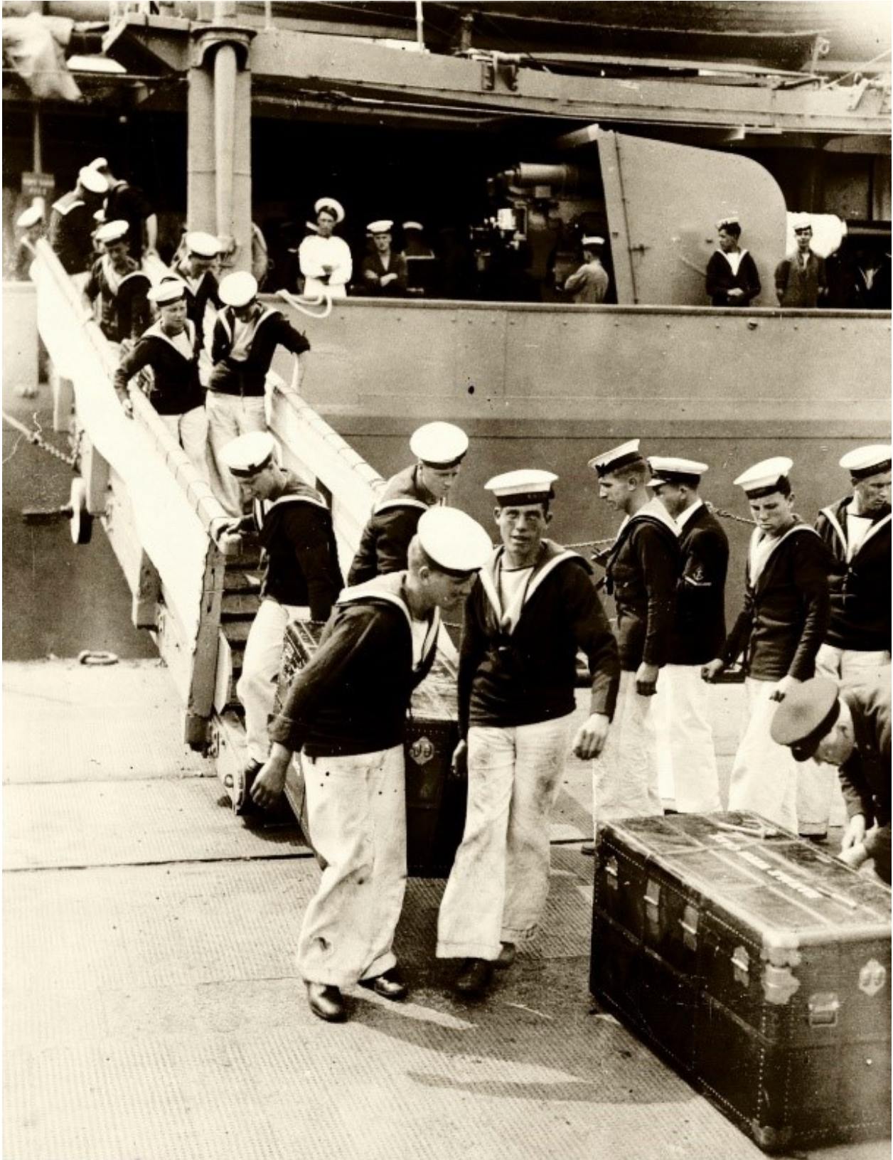
Archives Research on Chinese Government's Preparation for the 1935 Royal Academy International Exhibition of Chinese Art https://boasblogs.org/dcntr/archives-research-on-chinese-governments-preparation-for-the-1935-royal-academy-international-exhibition-of-chinese-art/