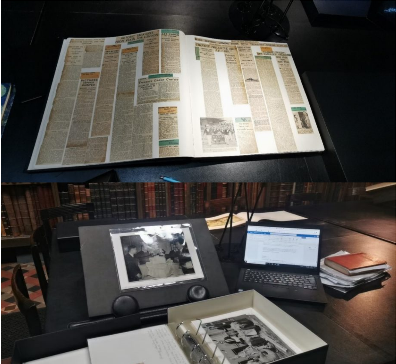
Fig. 2-3: Working with archives in the Royal Academy Library.