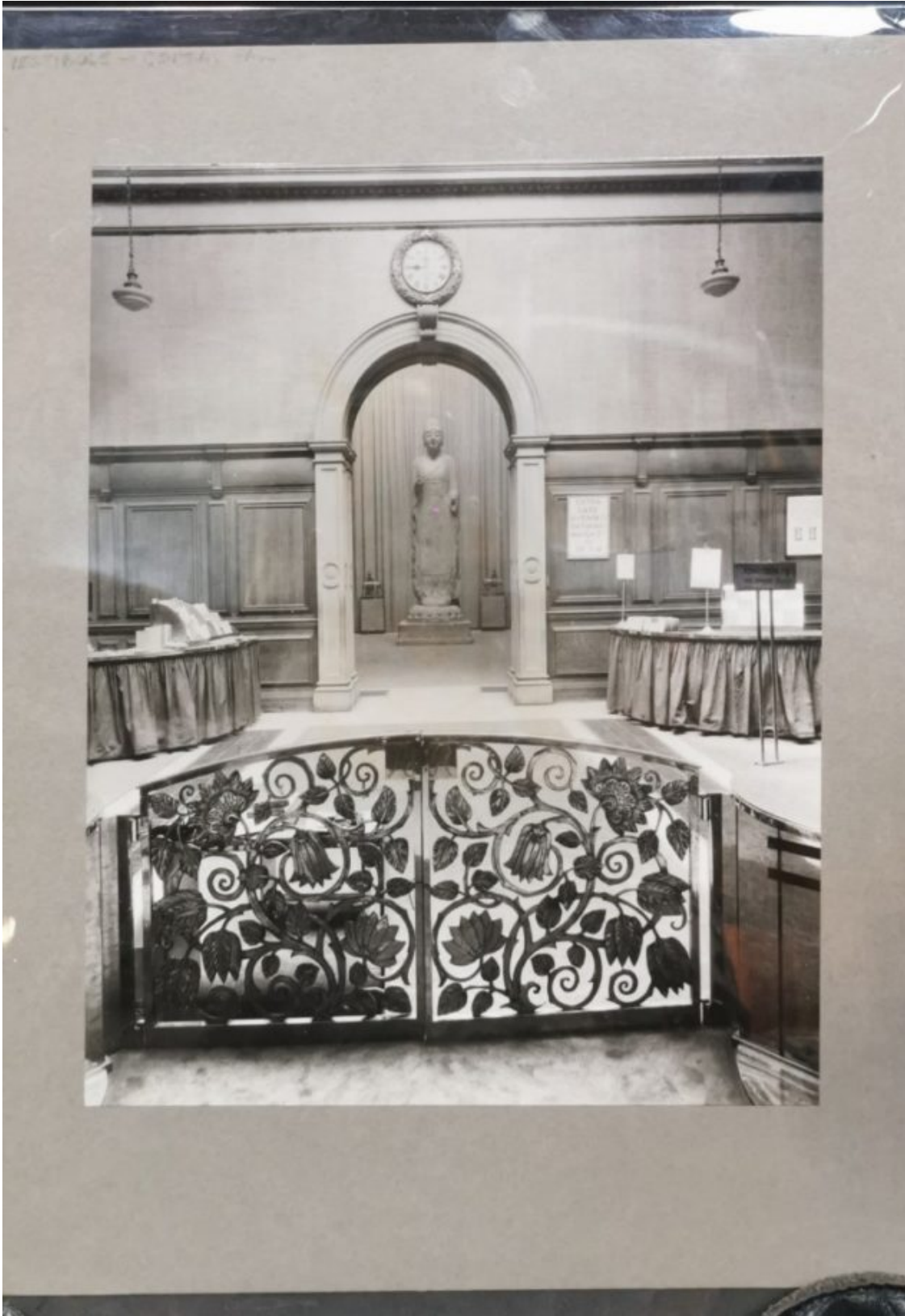
Archives Research on Chinese Government's Preparation for the 1935 Royal Academy International Exhibition of Chinese Art https://boasblogs.org/dcntr/archives-research-on-chinese-governments-preparation-for-the-1935-royal-academy-international-exhibition-of-chinese-art/