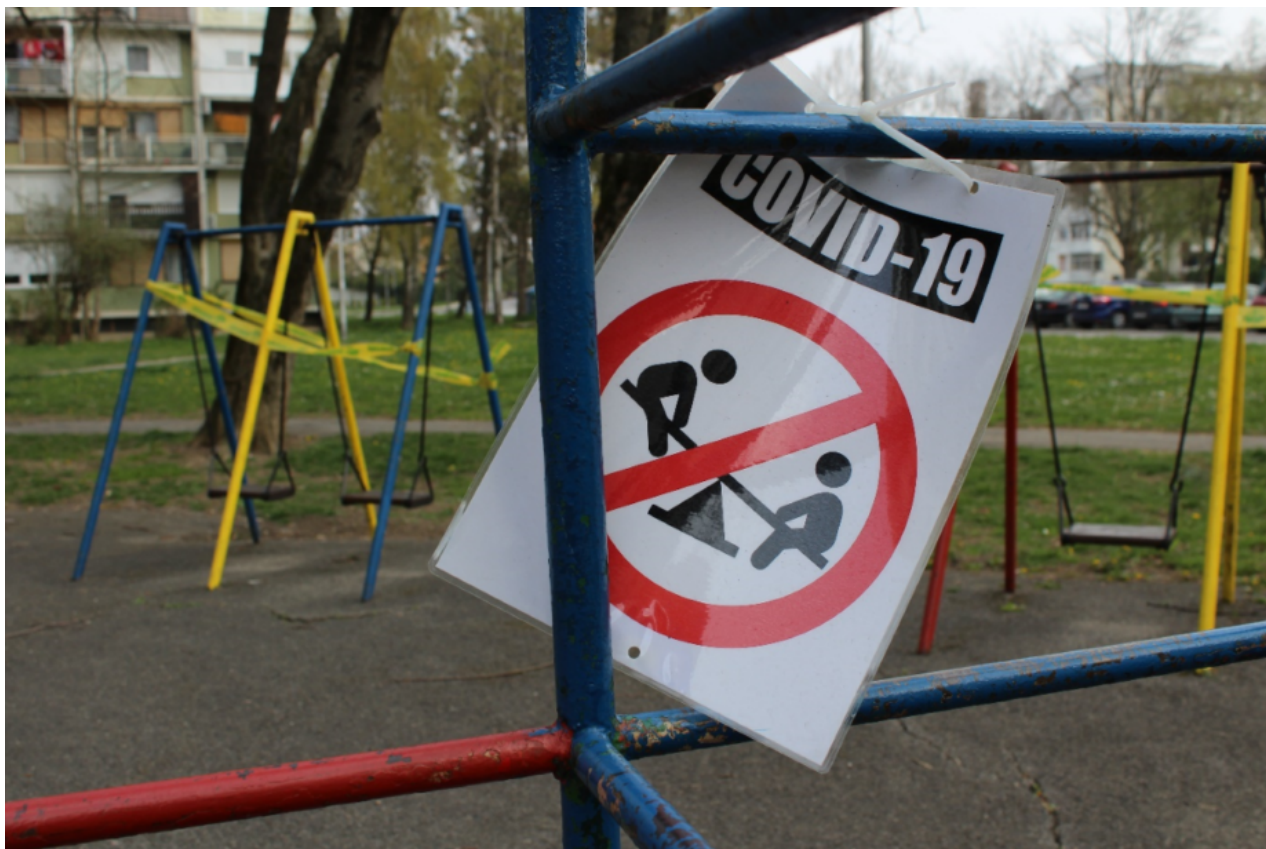
COVID 19 closed children playground in Gajnice, Zagreb