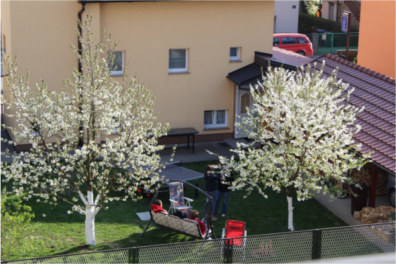
Family hanging in garden.

"We are now living in a disaster movie and it just begins."