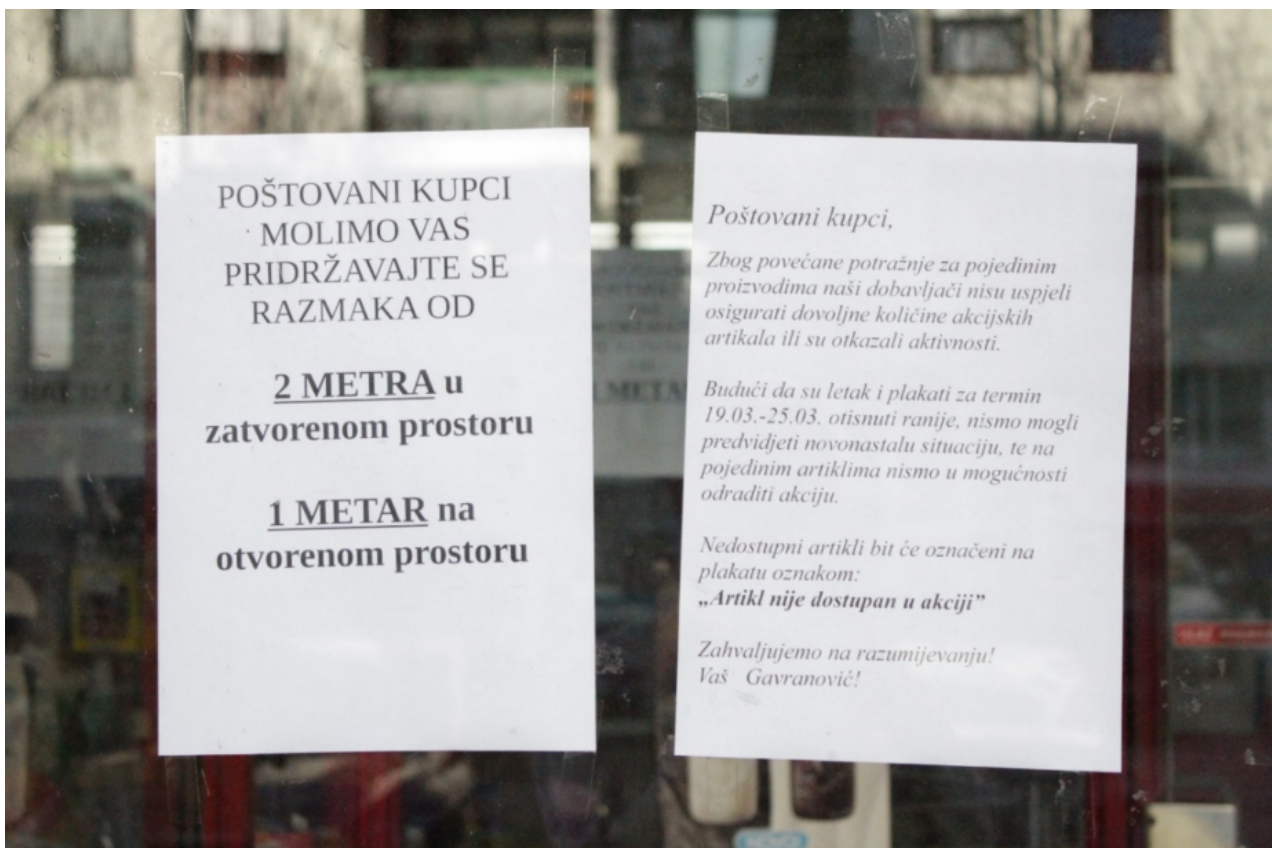
Photo of grocery in Zagreb (neighbourhood Stenjevec). It says to stay 2 metres from each other in closed space and 1 metre in open. Some articles are not available because of high demand

Today I took a walk to photograph doors of closed shop in neighbourhood to document corona age.