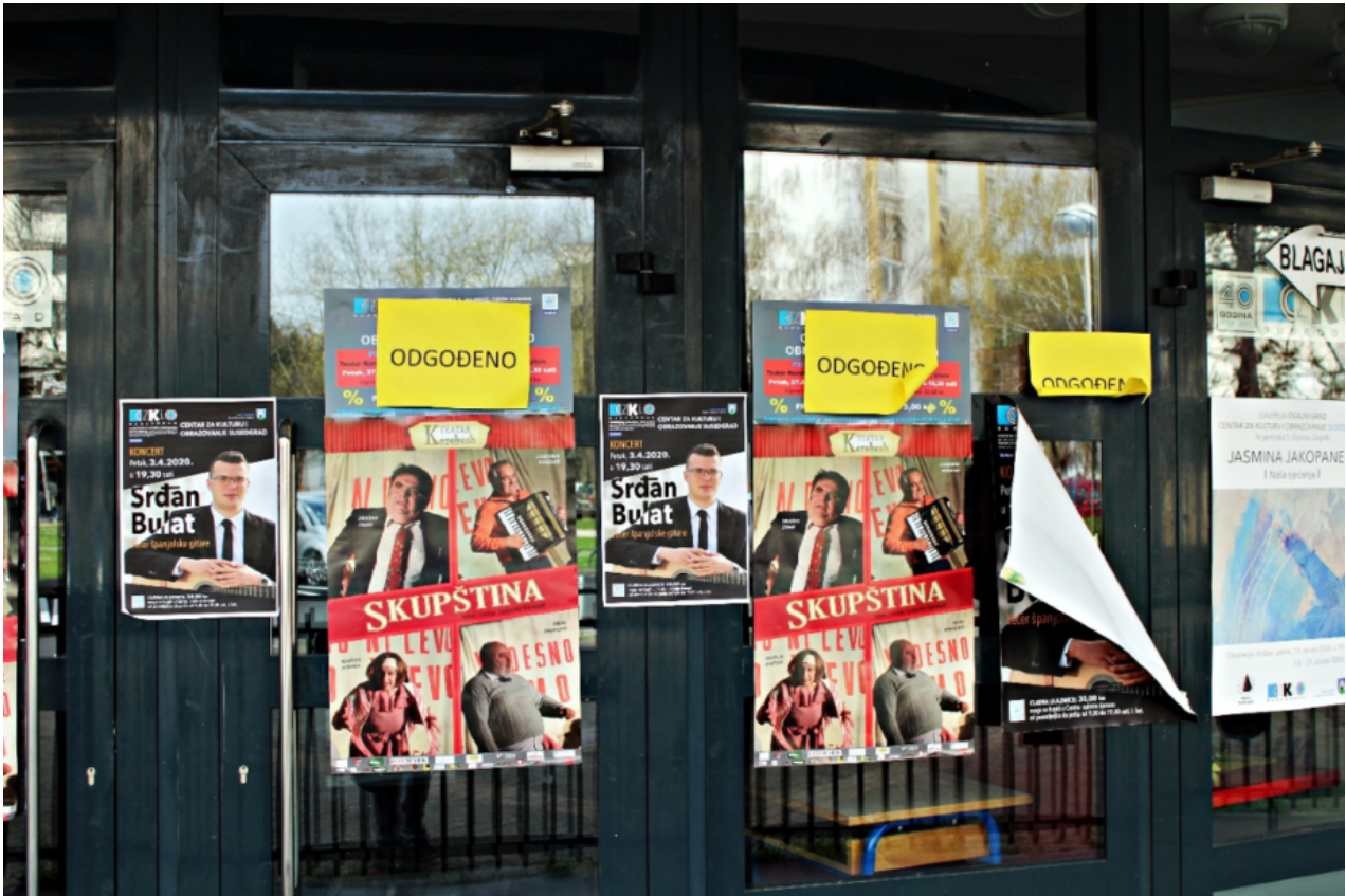
Local theater in Gajnice quartier Zagreb: ODGOĐENO means postponed

"We are now living in a disaster movie and it just begins."