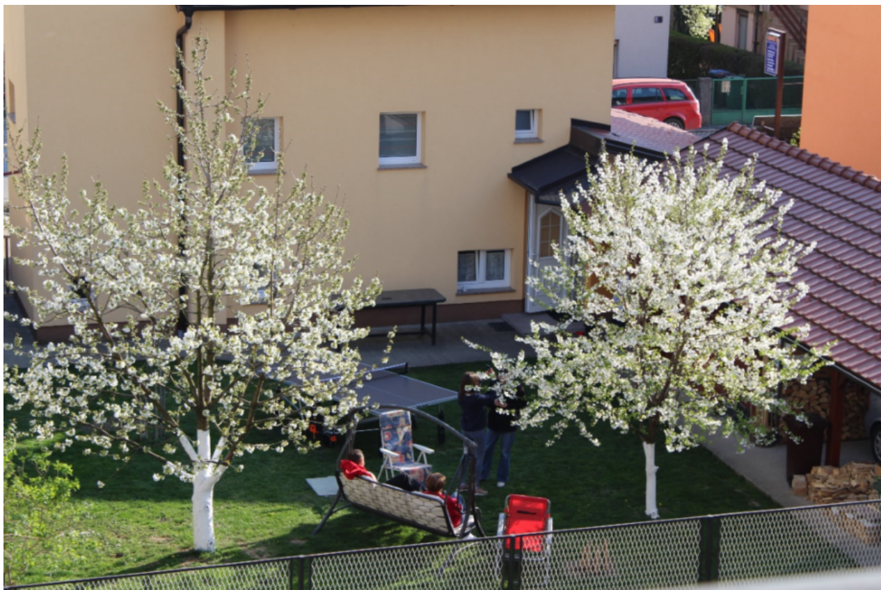
Family hanging in garden.

"We are now living in a disaster movie and it just begins."