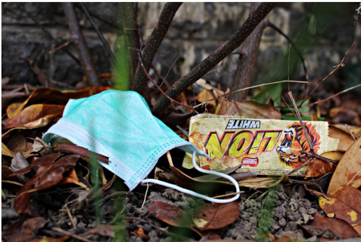
Thrown away mask in Gospodska street in Zagreb

"We are now living in a disaster movie and it just begins."