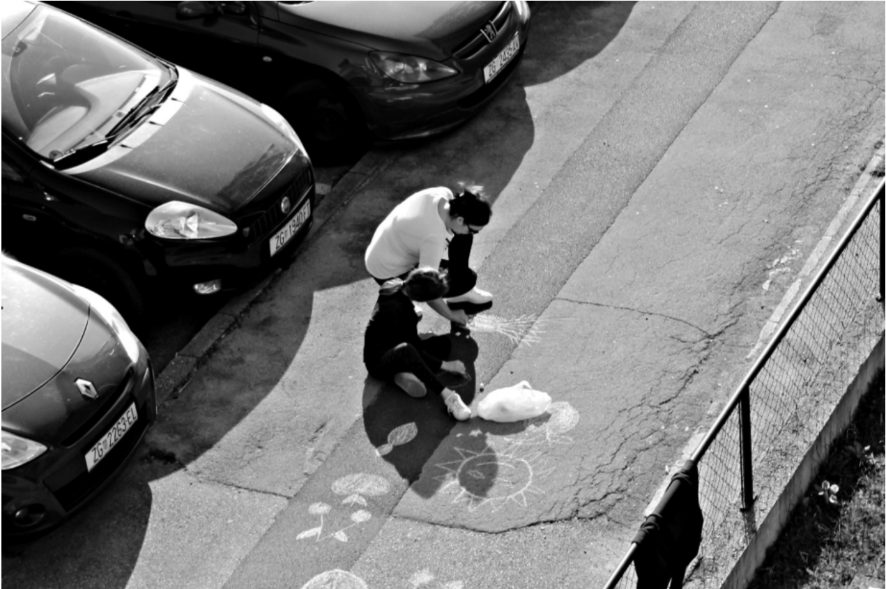
Woman drawing with her daughter.