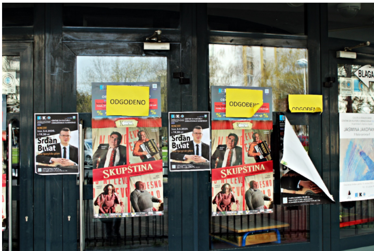
Local theater in Gajnice quartier Zagreb: ODGOĐENO means postponed

"We are now living in a disaster movie and it just begins."