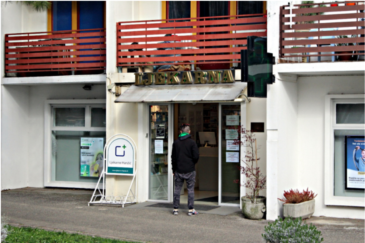
Man waiting in front of pharmacy to be invited – Gajnice, Zagreb