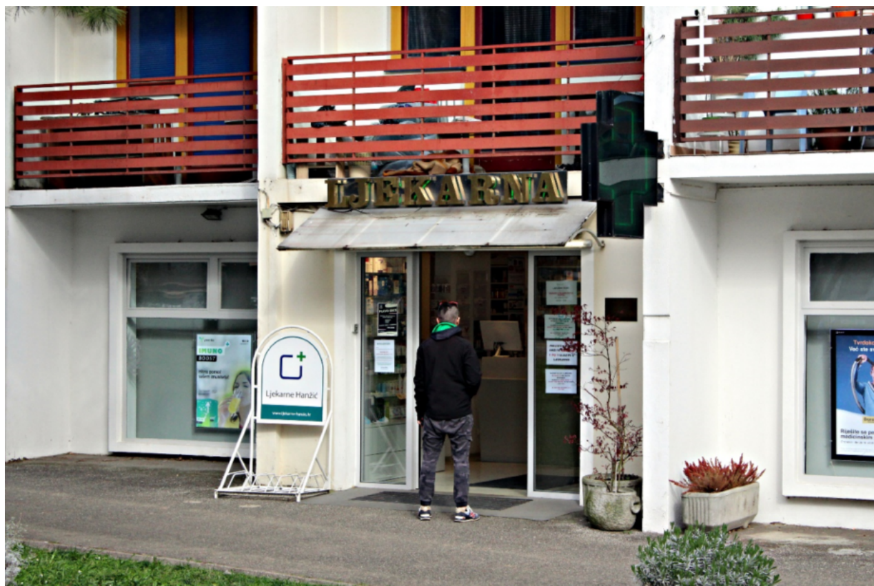
Man waiting in front of pharmacy to be invited – Gajnice, Zagreb ( 27.03.2020)