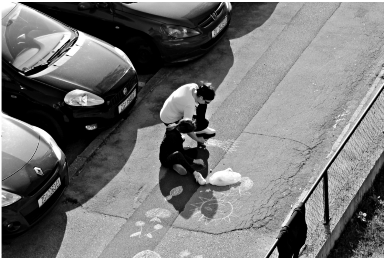
Woman drawing with her daughter.