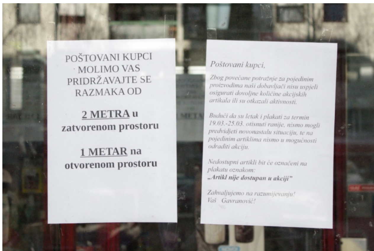
Photo of grocery in Zagreb (neighbourhood Stenjevec). It says to stay 2 metres from each other in closed space and 1 metre in open. Some articles are not available because of high demand

Today I took a walk to photograph doors of closed shop in neighbourhood to document corona age.