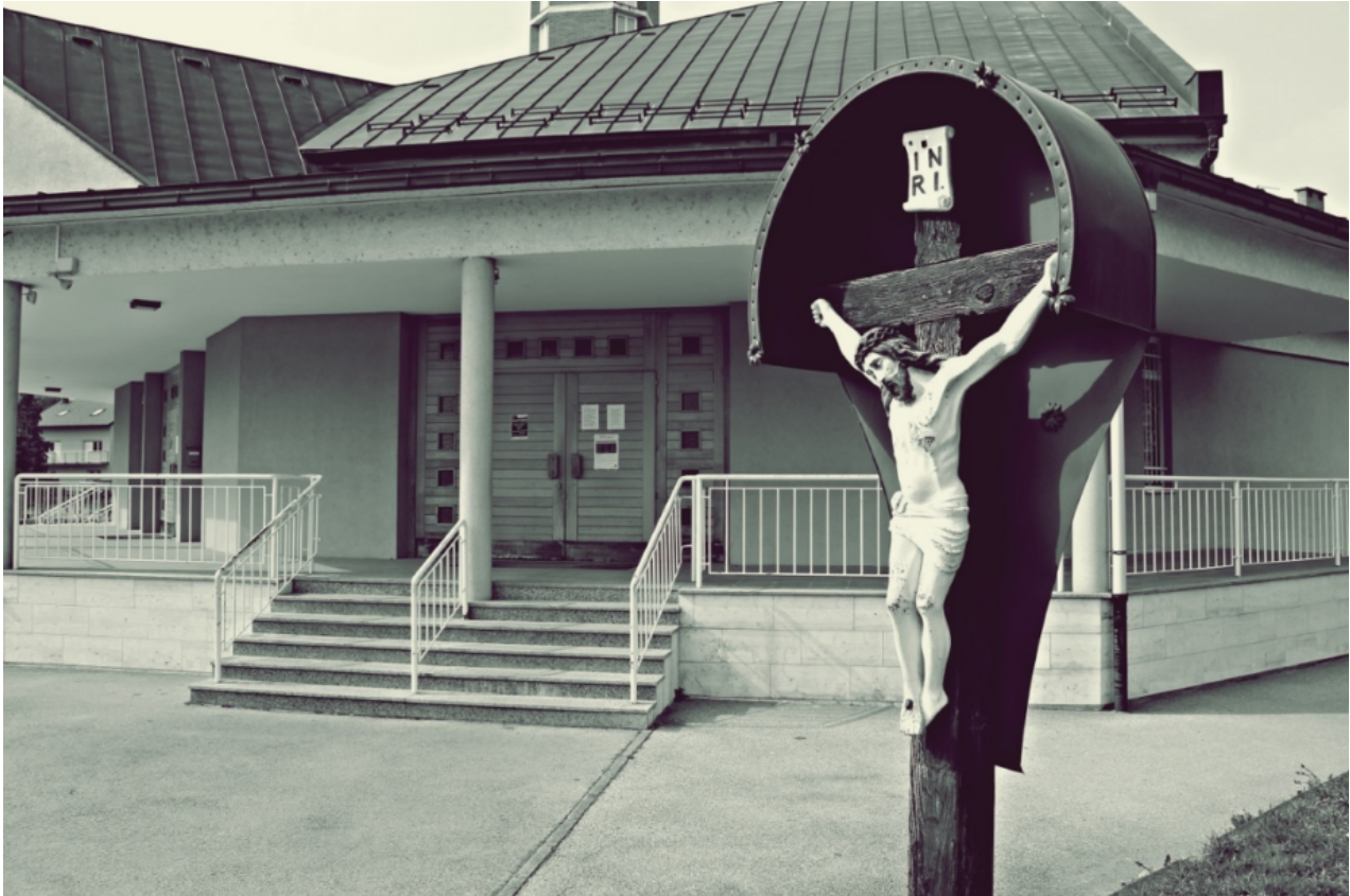
IMAGE 12. My local church Saint Nicholas, Stenjevec, Zagreb, closed doors.