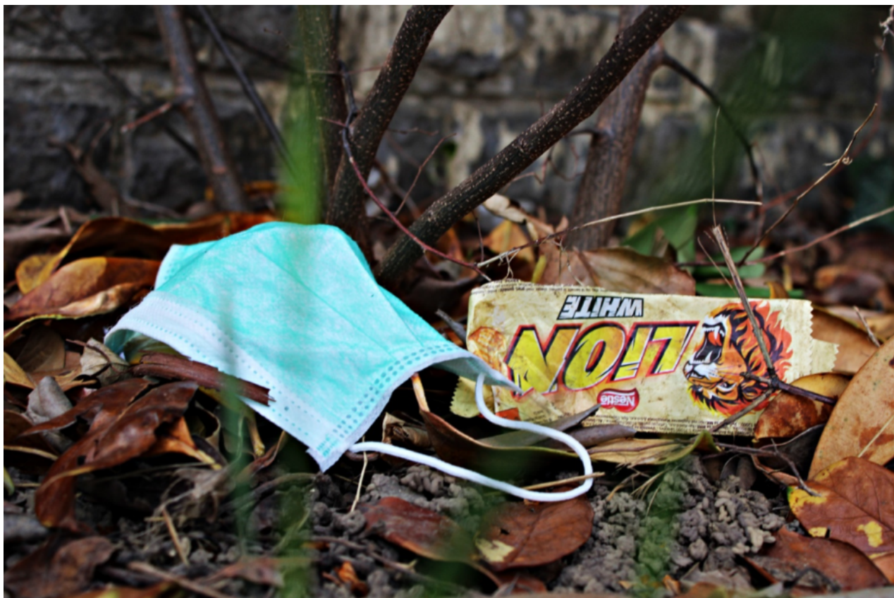
Thrown away mask in Gospodska street in Zagreb

"We are now living in a disaster movie and it just begins."