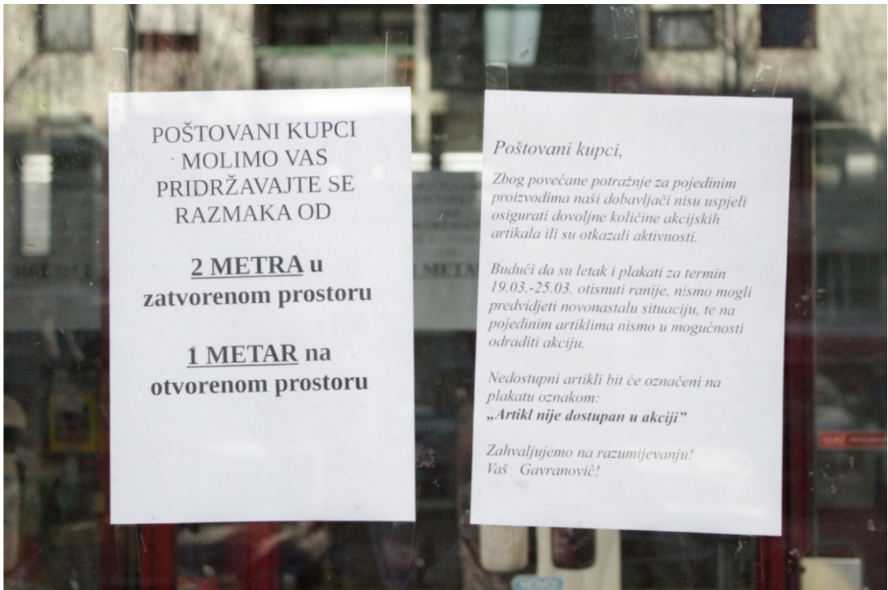
Photo of grocery in Zagreb (neighbourhood Stenjevec). It says to stay 2 metres from each other in closed space and 1 metre in open. Some articles are not available because of high demand

Today I took a walk to photograph doors of closed shop in neighbourhood to document corona age.