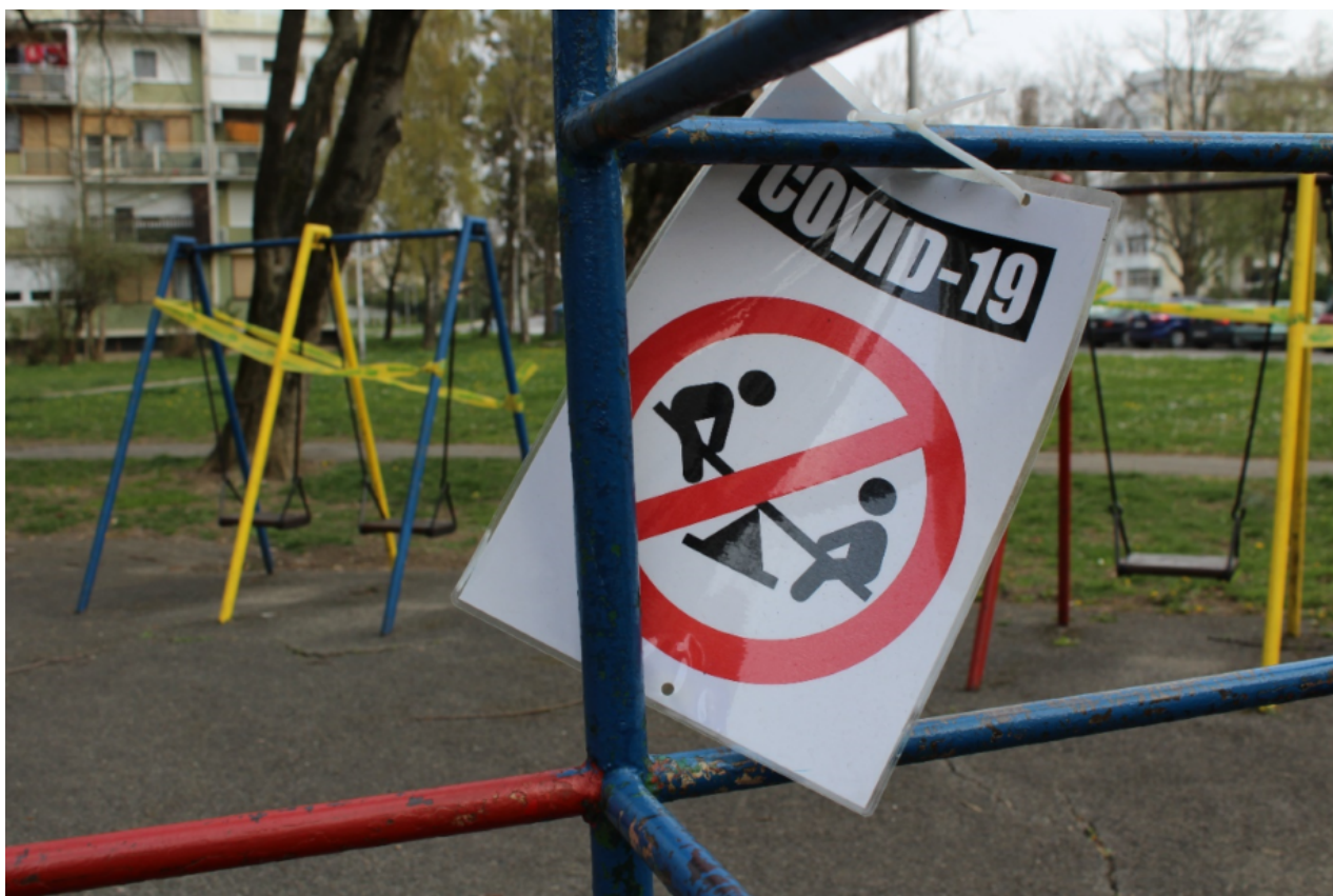
COVID 19 closed children playground in Gajnice, Zagreb

"We are now living in a disaster movie and it just begins."