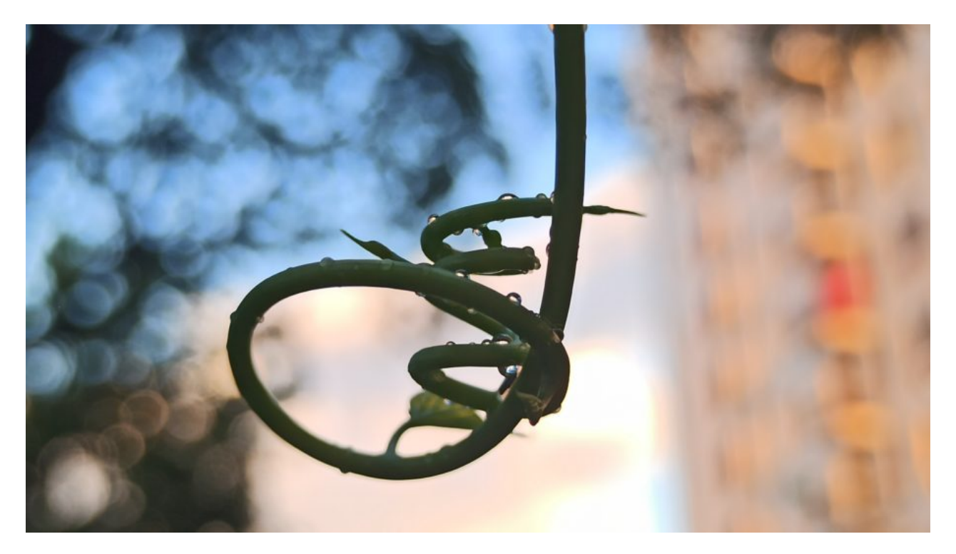
Boredom leads to interesting photography experiments during lockdown: a plant tendril on the terrace.