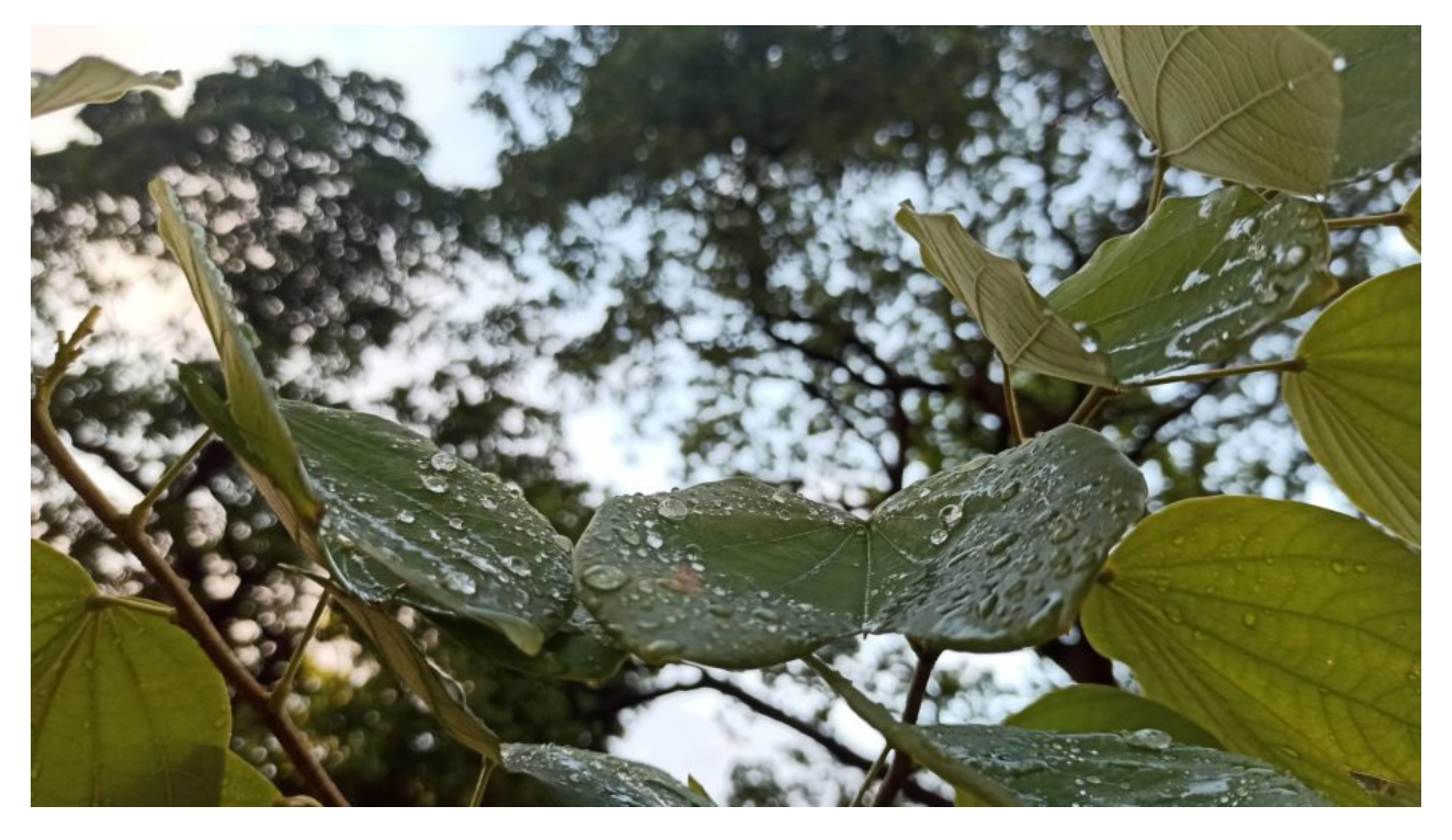
The monsoons arrive during the lockdown.

How are the quarantine experiences amongst the different people I wonder? What about the poor people who are crowded together in the slums. I have seen a lot of people pursuing their hobbies during this period, especially privileged people or those who live in the developed nations. We have the medium and space for such engagements. But what about those who cannot. I wonder what they are facing.